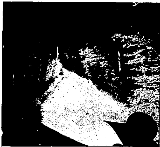
THE AVENUE, EFFINGHAM.

ONE of the most charming lanes in Surrey. When this picture was taken the only light available was that obtained from the pair of C.A.V. MODEL "F" HEAD LAMPS fitted to the Car.