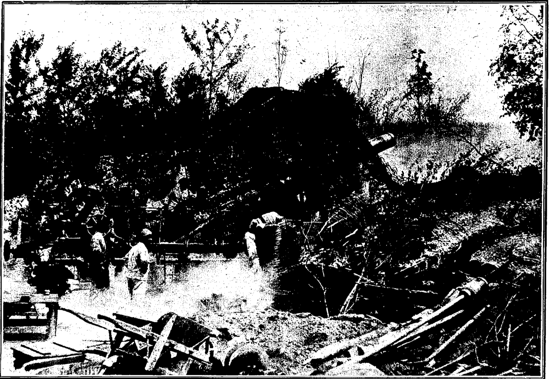
A POWERFUL FRENCH GUN INGENUOUSLY CONCEALED FROM VIEW ON THE EASTERN FRONT IN MACEDONIA RENDERS INVALUABLE AID. These huge field pieces have been used by the French in the Eastern war zone with similar effective results to those achieved in the Western area. It is confidently anticipated that the up-to-date French artillery will materially assist towards the early victory for which the Allies are striving so unceasingly and have made supreme sacrifices.