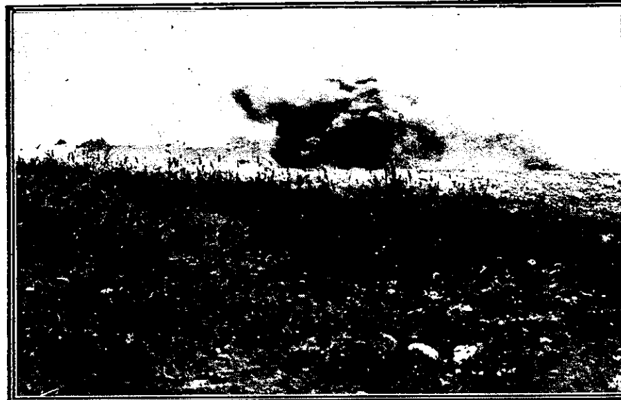
THE EXPLOSION OF A GIANT SHELL DURING OPERATIONS ON THE WESTERN FRONT.—PROFUSION OF PLOSIVES ARE SO POWERFUL AS TO TEAR HUGE CRATERS IN THE GROUND, AND CAUSE AN ERUPTION WHEN THEY STRIKE THEIR OBJECTS.