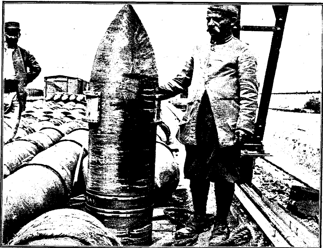
TREMENDOUS PROJECTILES USED BY THE FRENCH IN THEIR SUCCESSFUL BOMBARDMENT ON THE WESTERN FRONT. These costly shells are lifted by special cranes, and their destructive powers can well be imagined.