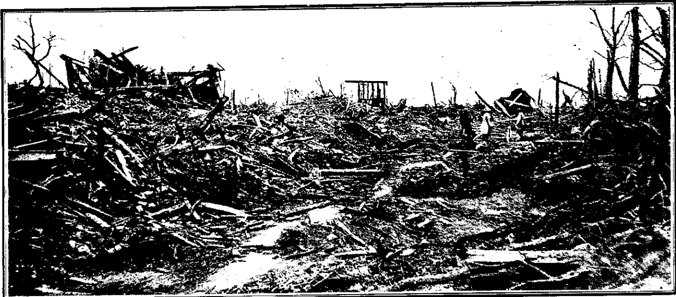
A SCENE OF DEVASTATION ON THE SOMME FRONT.—RUINS OF THE VILLAGE OF MAUREPAS, WHICH WAS COMPLETELY DESTROYED BY SHELL FIRE.