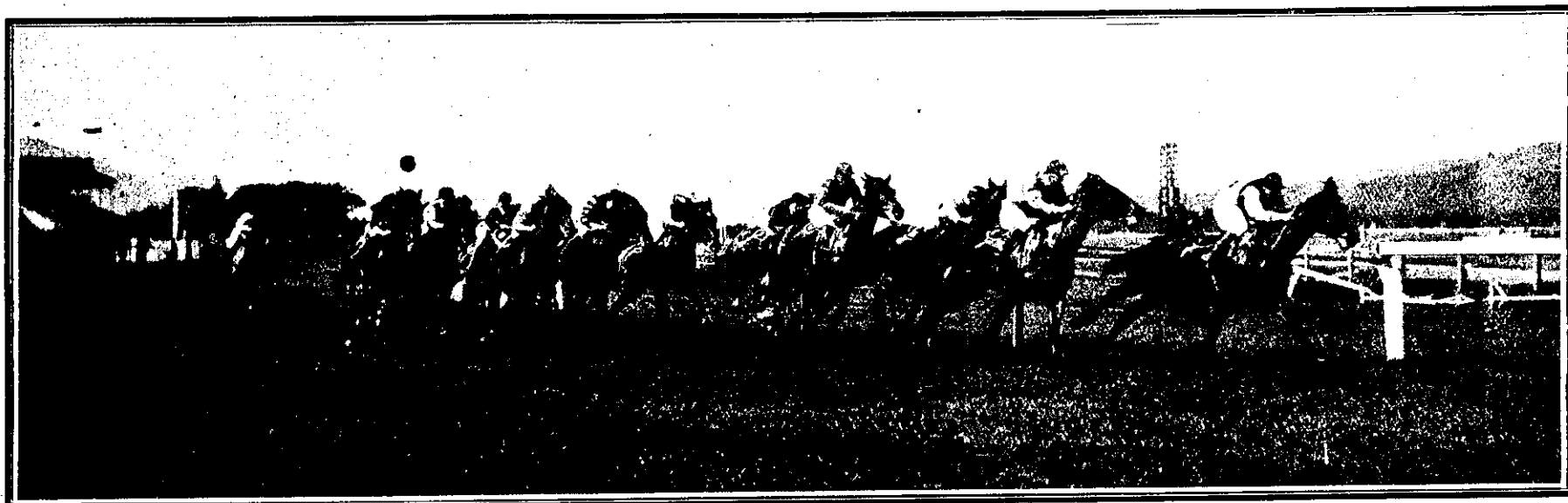
THE FIELD GOING OUT OF THE STRAIGHT IN THE WELLINGTON HANDICAP (1¼ MILES)—BLERIOT (W. BELL) SETTING THE PACE, FOLLOWED BY TARINGAMUTU (A. OLIVER) AND MASTER MOUTOA (NEXT RAILS).