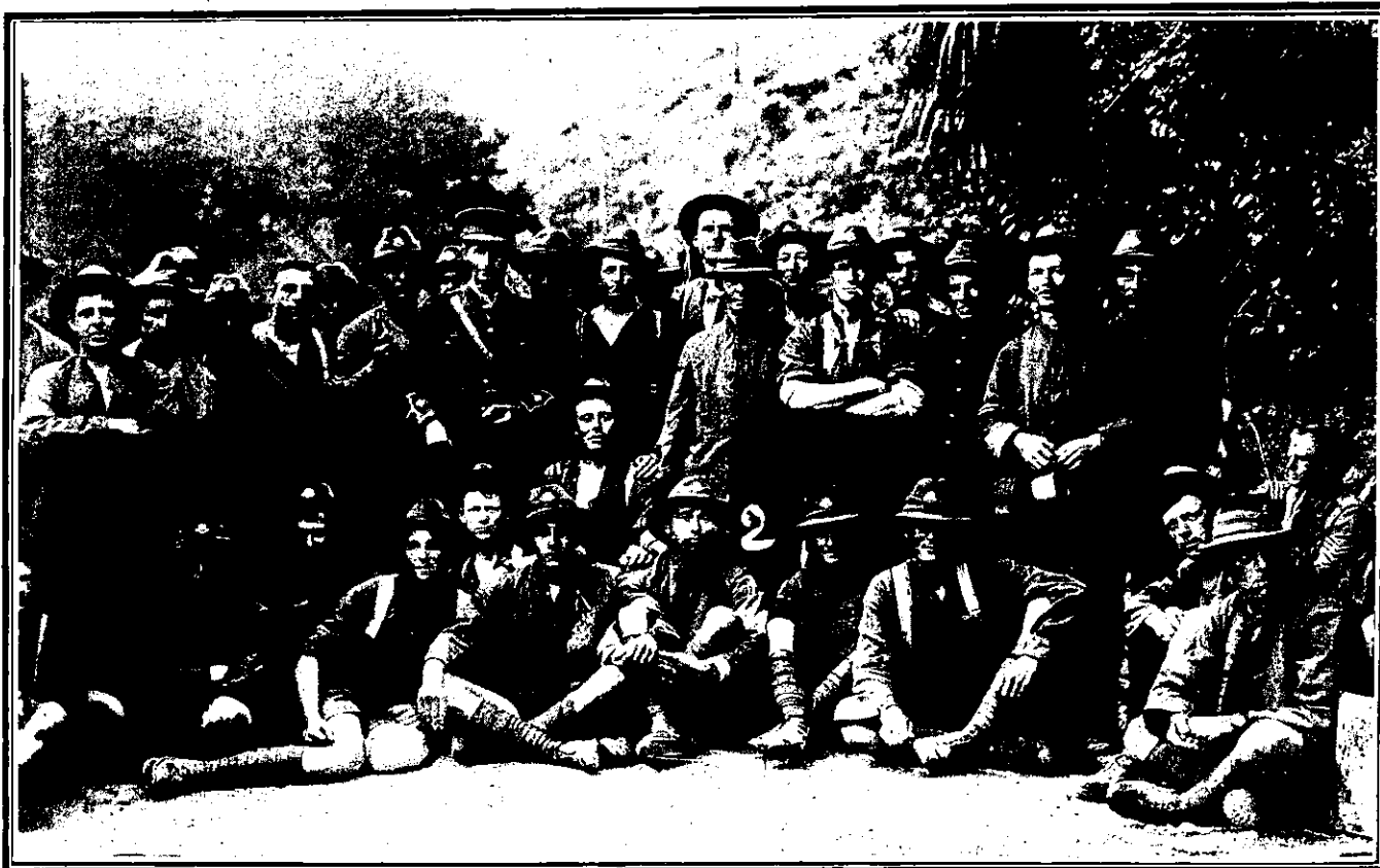
No. 1 PLATOON, A COMPANY, HAVING A SPELL AT THE TOP OF THE RIMUTAKAS DURING THE RECENT ROUTE MARCH OF THE EIGHTEENTH REINFORCEMENTS.