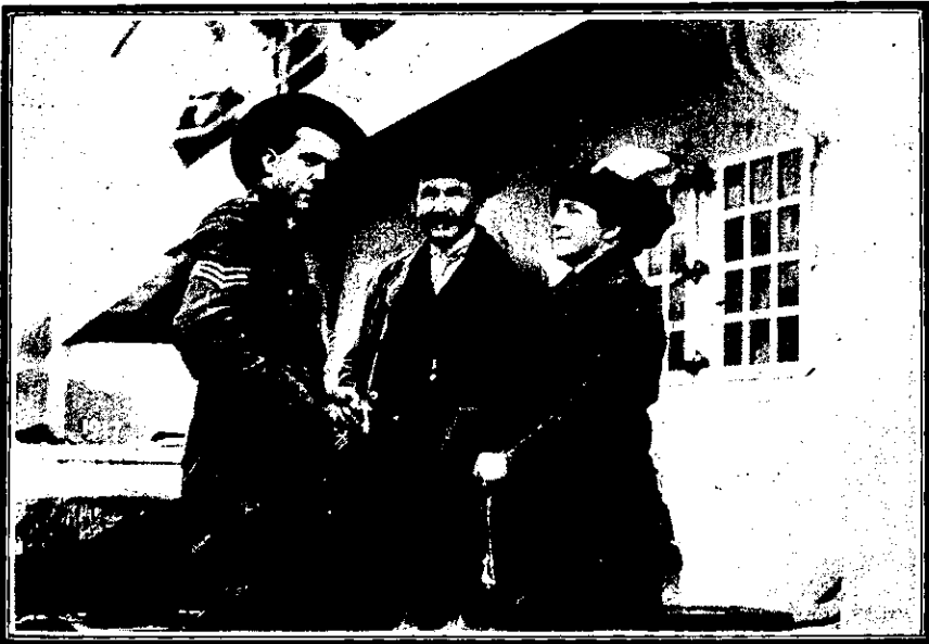
A returned Oamaru man welcomed home.