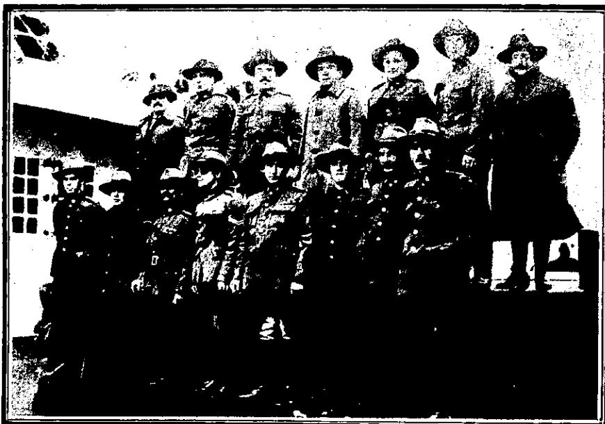
Group of Otago boys who have returned after duty nobly done.