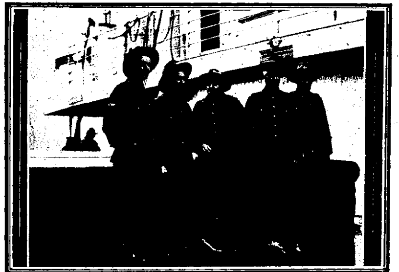
Battle-scarred warriors photographed on the wharf alongside the Willochra.