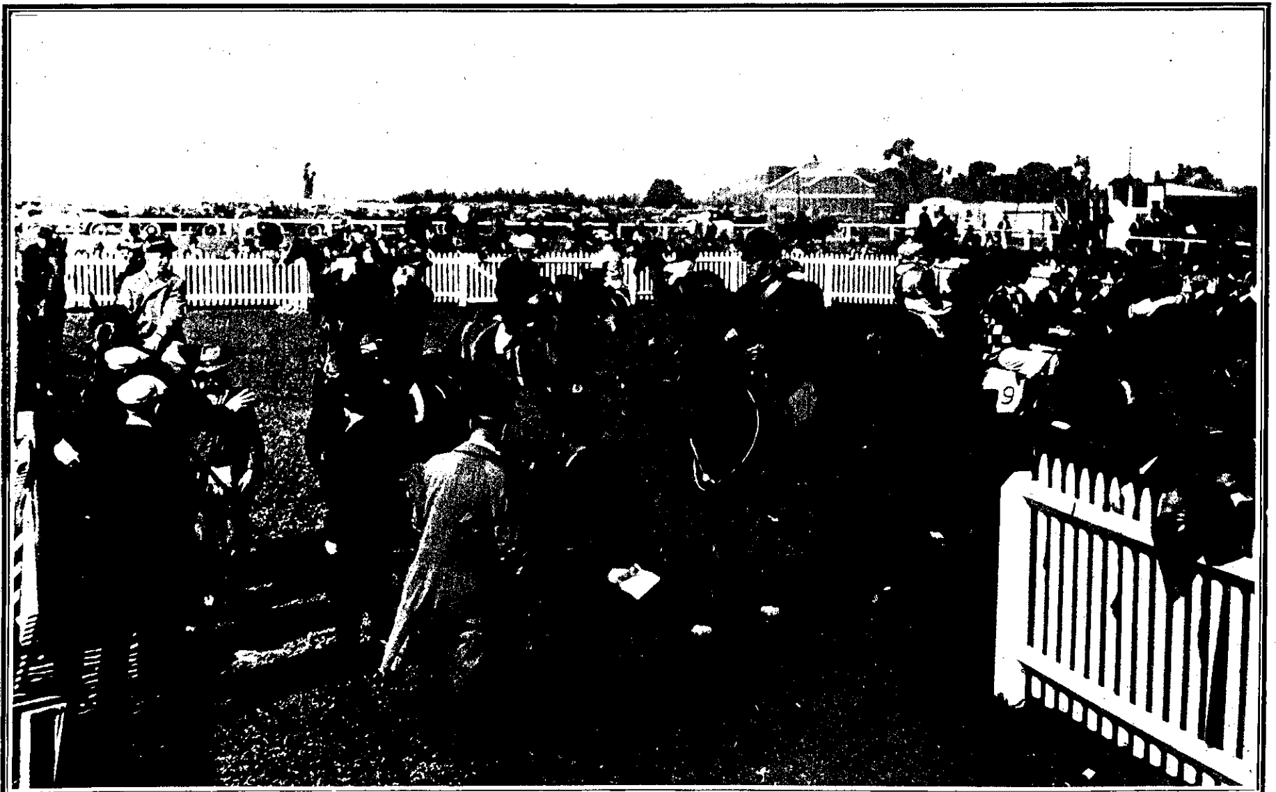
CANDIDATES READY TO LEAVE THE BIRDCAGE TO CONTEST THE PRINCIPAL EVENT, THE MARTON HANDICAP.