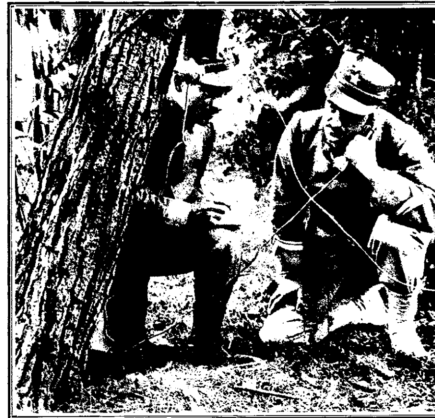
RECEIVING IMPORTANT INTELLIGENCE PRIOR TO LAUNCHING FORCES. AN IMPROVISED ITALIAN ARMY TELEPHONE FIELD PO