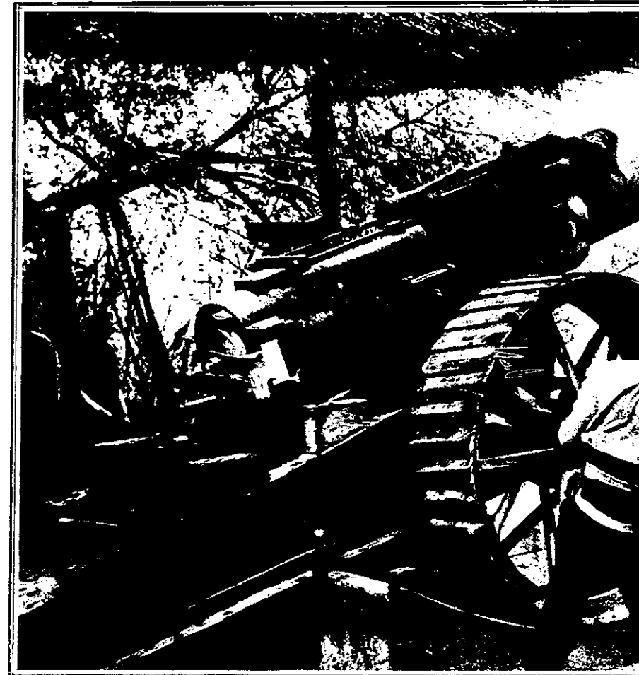
BRITISH GUNNERS INDULGE IN AN ARTILLERY DUEL WITH THE WAR AREA. The gun crew have stepped aside, the "trigger man" remains the big piece.