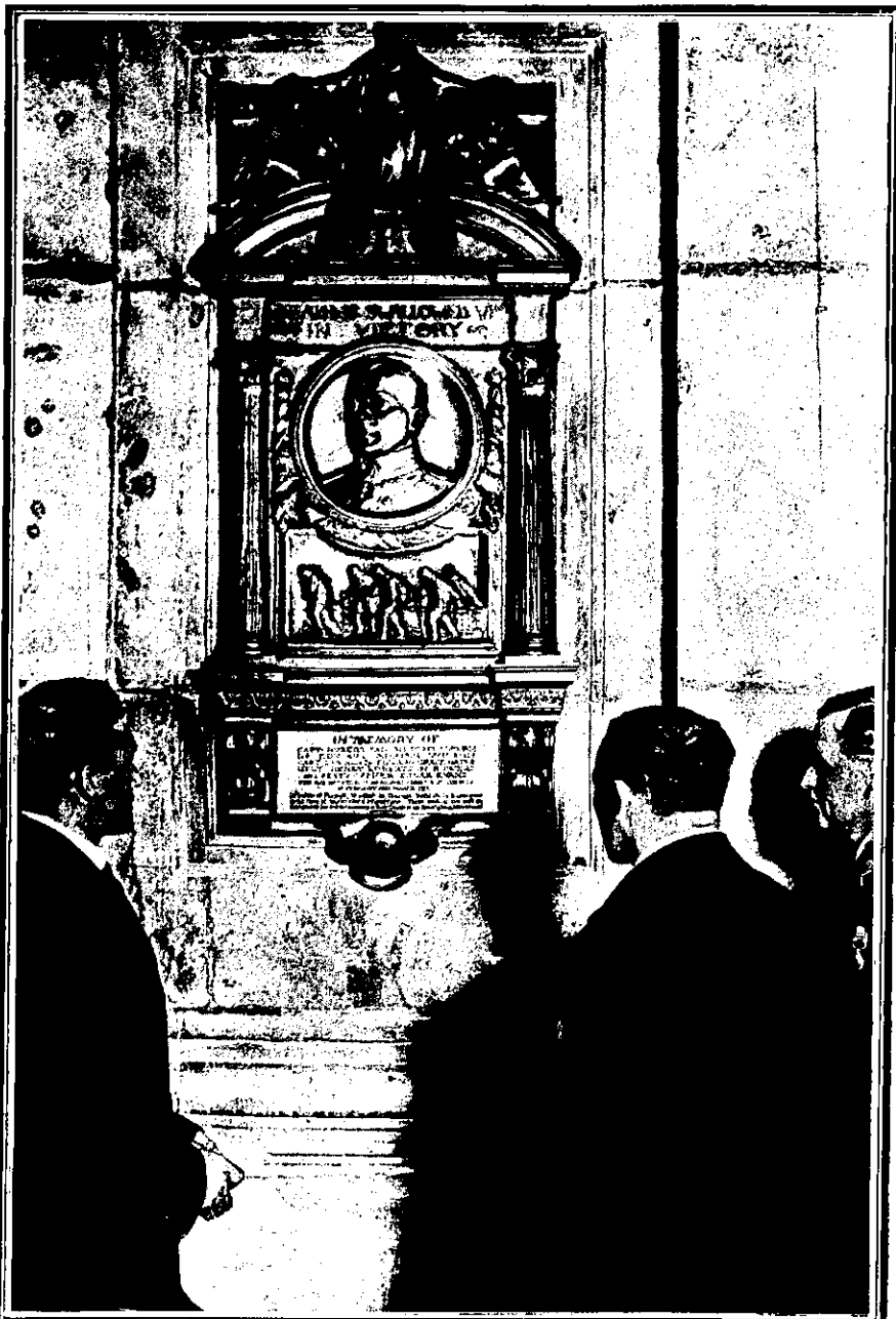
THE UNVEILING OF THE CAPTAIN SCOTT MEMORIAL IN ST. PAUL'S CATHEDRAL. A tribute to the memory of the famous British explorer, who perished in the Antarctic on March 29, 1912, was paid by the Right Hon. H. H. Asquith (Prime Minister) when he recently unveiled the memorial to Captain Scott. Some of Capt. Scott's men are shown admiring the memorial of their gallant leader.