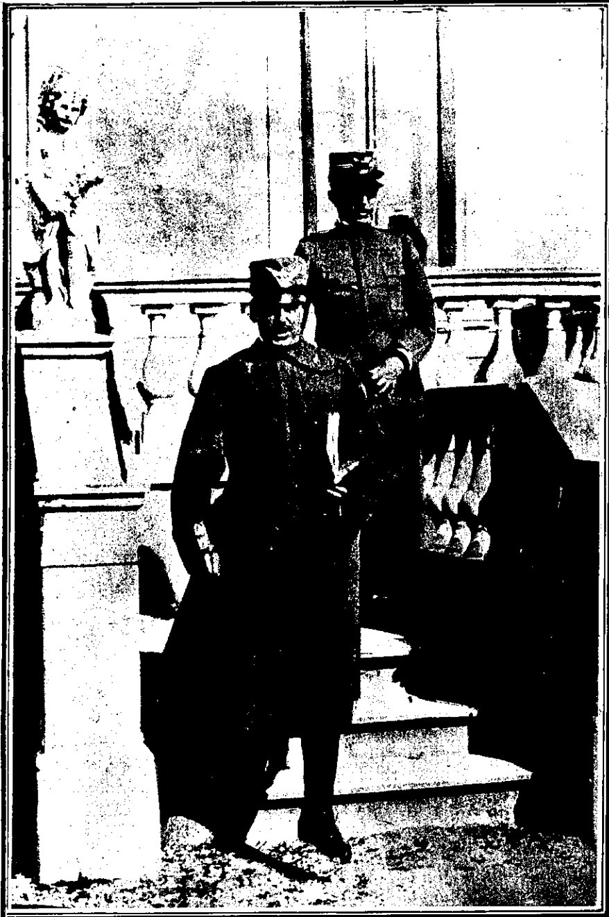
COUNT DE TURIN, A BRILLIANT ITALIAN CAVALRY LEADER, who was amongst those to receive the Prince of Wales during His Highness's recent visit to the King of Italy in the Isonzo region. Count de Turin is the Commander-in-Chief of the Italian Cavalry.