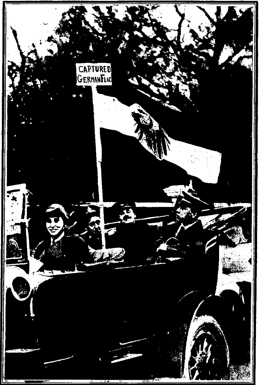
WOUNDED SOLDIERS' PARADE IN LONDON ON THE ANNIVERSARY OF THE SINKING OF THE LUSITANIA. The three soldiers in back of car are flying a captured German flag.