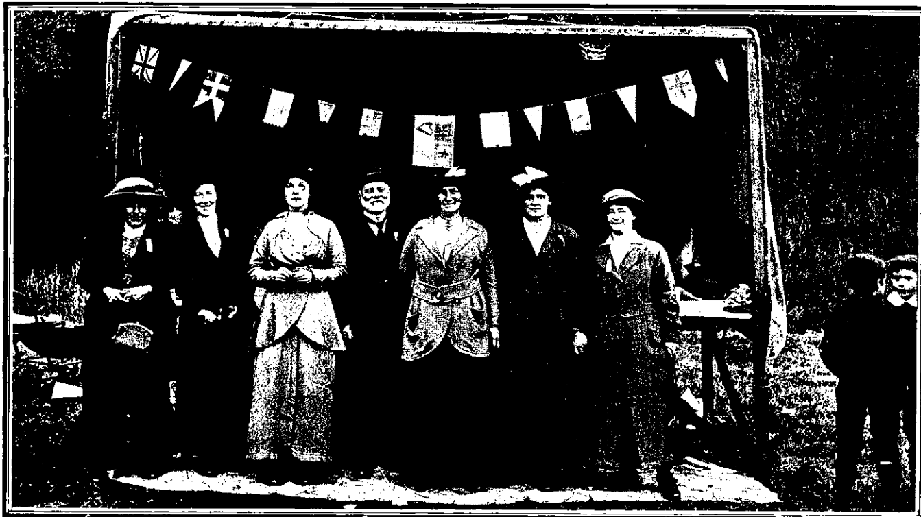
GROUP OF LADIES WHO HAD CHARGE OF THE SWEET STALL.