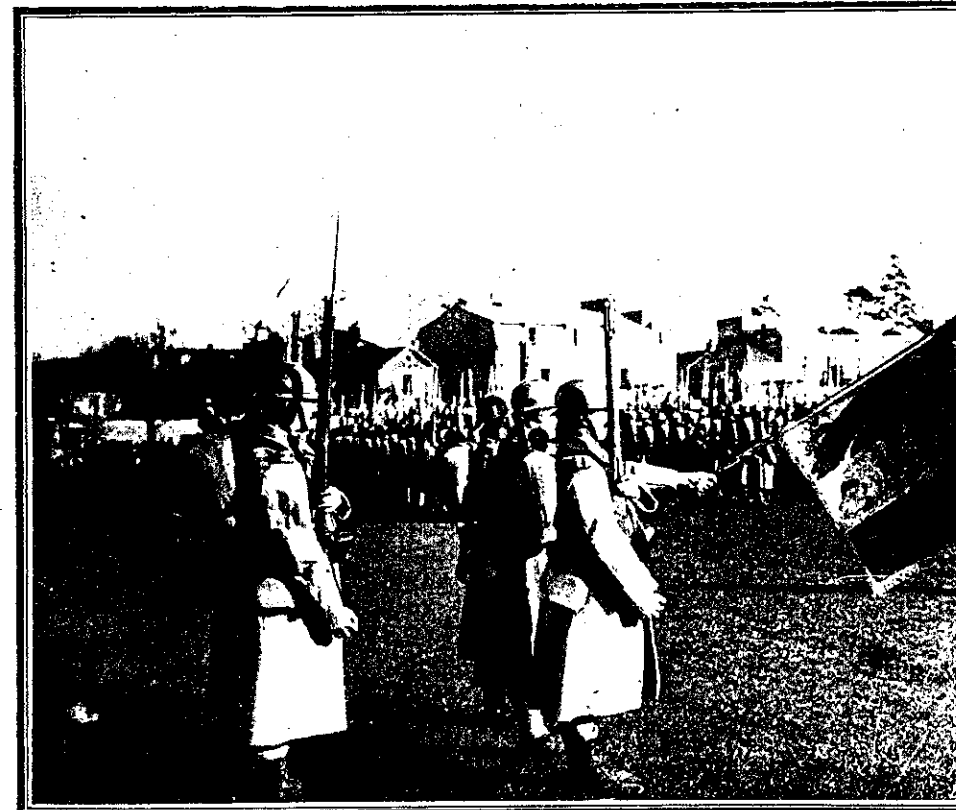
A GREAT DAY ON THE WESTERN FRONT. GENERAL JOFFRE REVIEWING THE BRITISH TROOPS WHOSE GREAT COURAGE HAS BEEN DEMONSTRATED DURING THEIR CAMPAIGN WITH THE GERMANS.