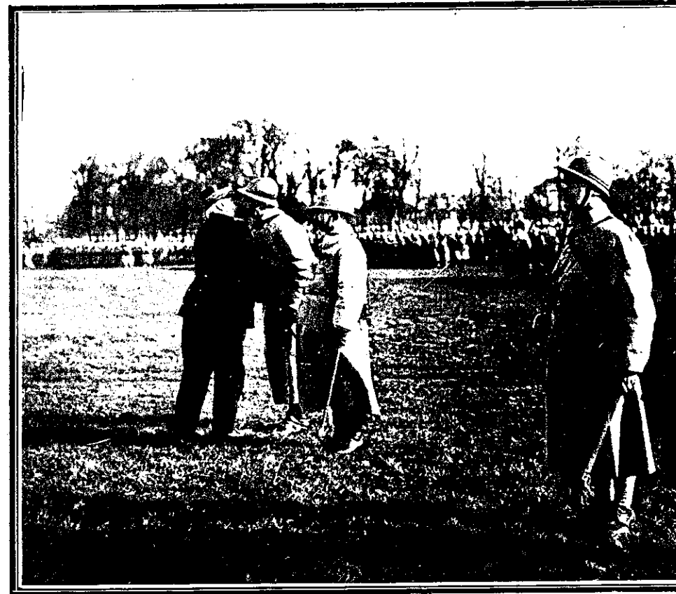
GENERAL JOFFRE, COMMANDER-IN-CHIEF OF THE ALLIES' FORCES, PRESENTING DECORATIONS TO DISTINGUISHED FRENCH SOLDIERS. THE GENERAL IS ON THE RIGHT, EMBRACING THE RECIPIENT OF A DECORATION.