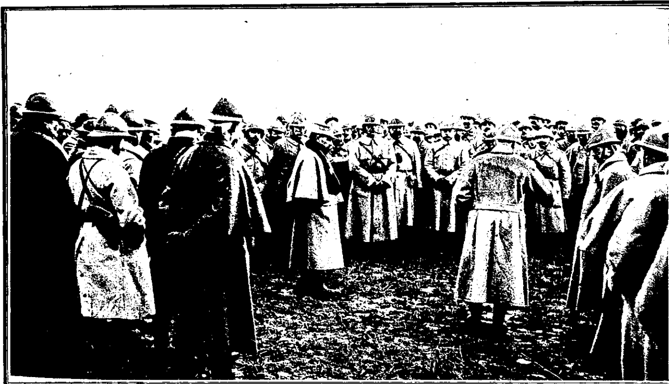
AN ASSEMBLAGE OF FRENCH HEROES, WHOSE GALLANT DEFENCE OF VERDUN IS ONE OF THE MOST NOTEWORTHY ACCOMPLISHMENTS OF THE WAR—A striking illustration showing some defenders of Verdun. General Dubail presiding over a conference held on the battlefield. A general is explaining to the officers the reasons why the recent offensive in Champagne failed.