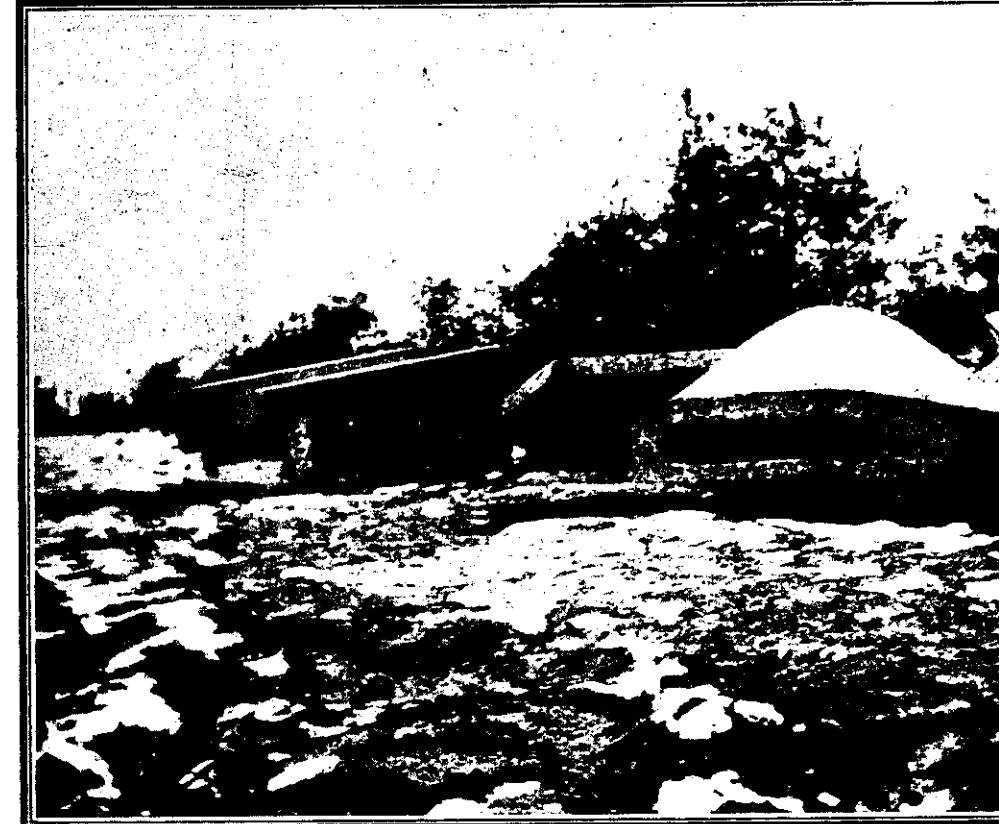
THE EFFECTIVE ARTILLERY FIRE OF THE FRENCH—A GERMAN FORT AND REINFORCED CONCRETE DESTROYED BY A BIG FRENCH SHELL GION.