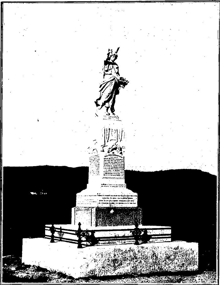
AN IMPOSING STATUE RECENTLY UNVEILED AT KAITAIA, NORTH AUCKLAND, IN HONOUR OF THOSE BRAVE SOLDIERS HAILING FROM MANGONUI WHO LOST THEIR LIVES IN FIGHTING FOR THE EMPIRE. The inscription on the statue is in both English and Maori, and reads as follows:—"In loving memory and in honour of our sons and relations, both Maori and Pakeha, who willingly offered themselves to sacrifice their lives to uphold the honour of the King and Empire for the Glory of God in this terrible war which began in Europe in August, 1914, and has since spread over the greater part of the world."