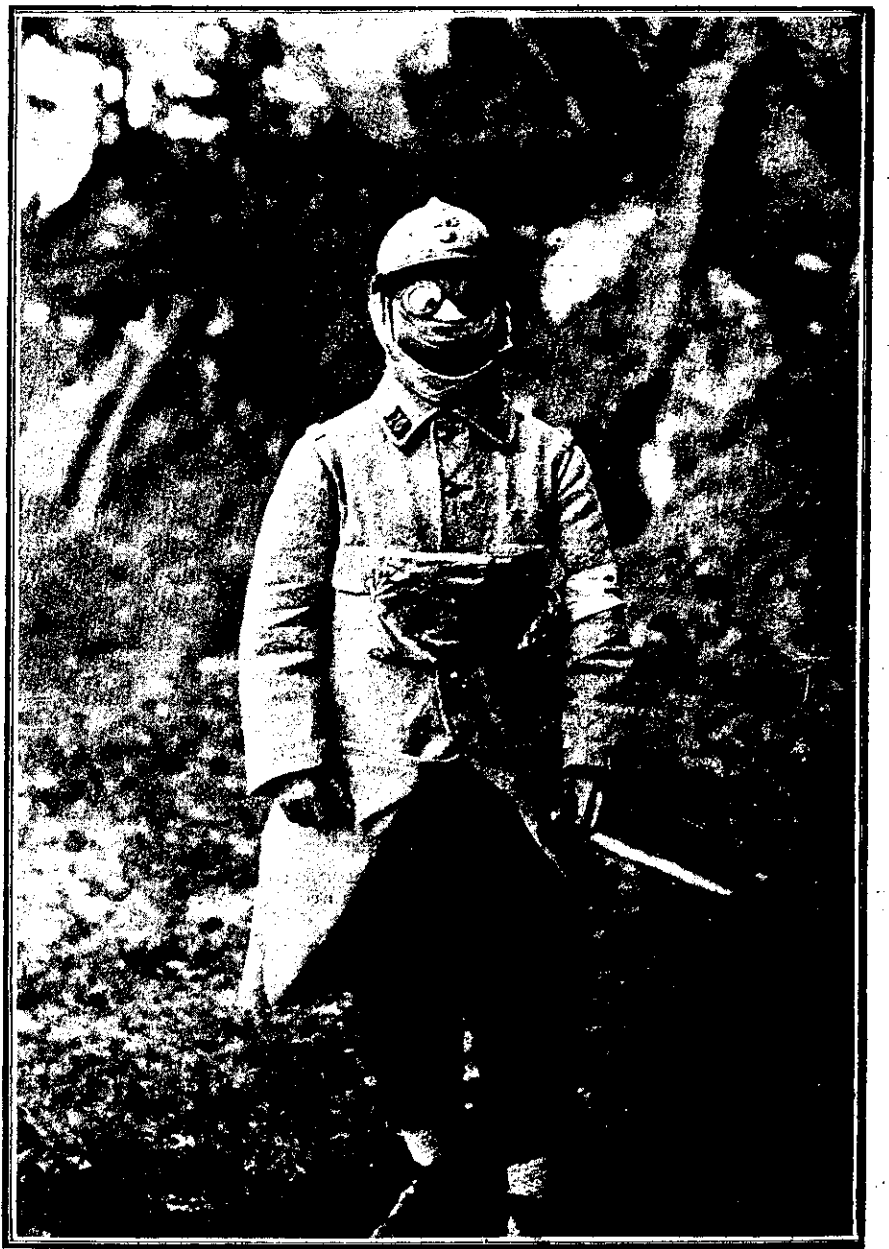
PROTECTING THE FRENCH SOLDIER AGAINST THE GERMAN GASES—A RESPIRING APPLIANCE IN USE.