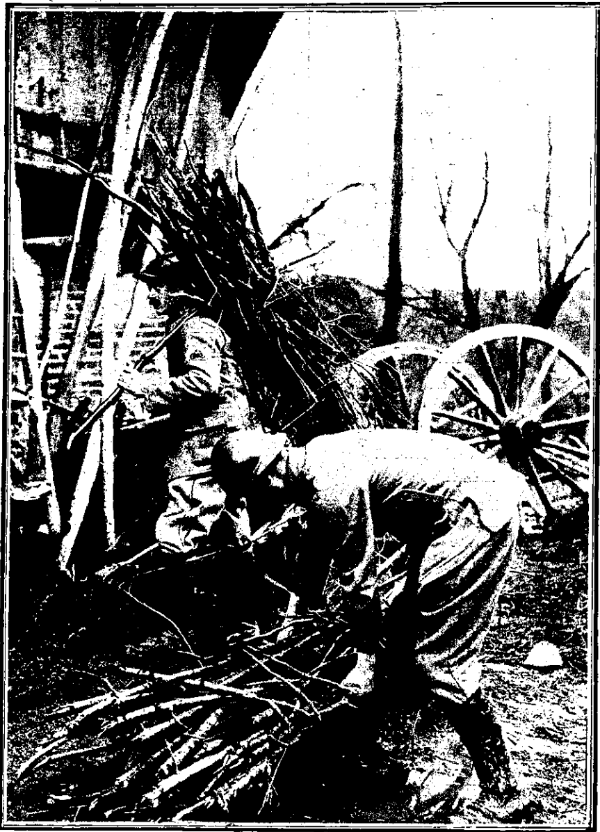
MEMBERS OF A FRENCH CYCL'NG CORPS ON ACTIVE SERVICE. SOLDIERS ON DUTY CARRYING WOOD FOR FUEL.