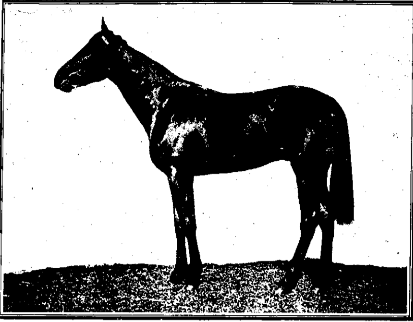
Three-year-old brown colt CROWN IMPERIAL (imp.), by Martagon—Macaroon.