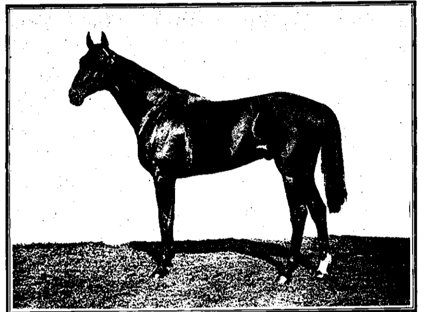
A WELL-KNOWN PERFORMER—Brown horse EXPECT, 6yrs., by Advance—Endeavour.