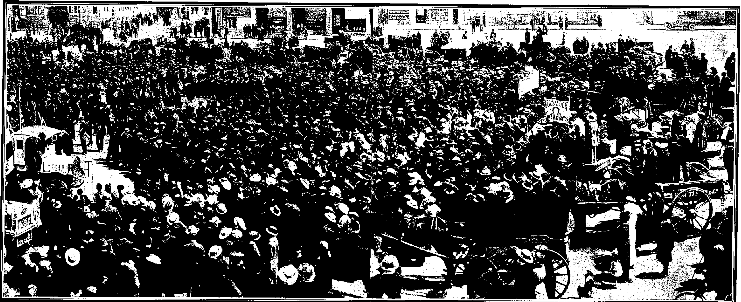
AN ENTHUSIASTIC SCENE OUTSIDE THE DUNEDIN RAILWAY STATION DURING THE FAREWELL CEREMONY TO OTAGO RECRUITS LEAVING TO GO INTO CAMP AT TRENTHAM.