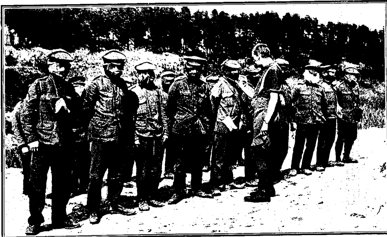
BRITISHERS TAKE PRECAUTIONS AGAINST THE DEADLY GASSES EMPLOYED BY THE GERMANS—RESPIRATOR PARADE FOR BRITISH TROOPS AT THE FRONT.