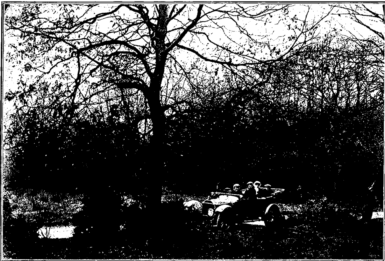
A PICTURESQUE ENGLISH SCENE NEAR NORTH LONDON—A MOTORING PARTY PASSING THROUGH THE BEAUTIFUL EPPING FOREST.

Were I so tall to reach the sky, Or take the ocean in my span, What use is length, unless there's strength, Now tell me if you can. Suppose I'm ill, with rasping cough Or tickling throat—well, to be sure, I don't talk length, I gather strength With Woods' Great Peppermint Cure.