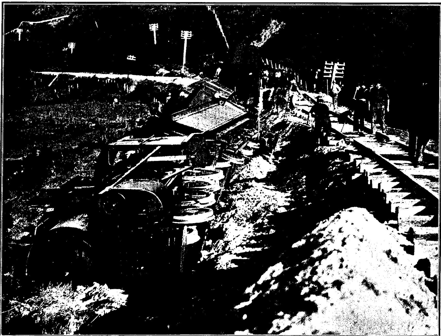
THE CAPSIZED ENGINES AND POSTAL VAN EMBEDDED IN THE SOFT PUMICE.—A gang of workmen are seen relaying the rails to enable the Main Trunk express to pass the obstruction.