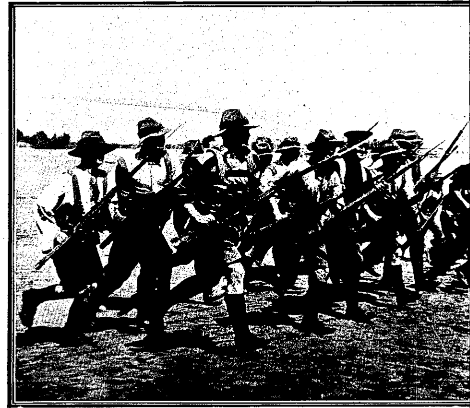
THE INSPECTION OF THE TROOPS IN EGYPT BY SIR HENRY MAC The illustration shows a Company of New Zealanders dashing past at th with fixed bayonets, and shouting a Maori war