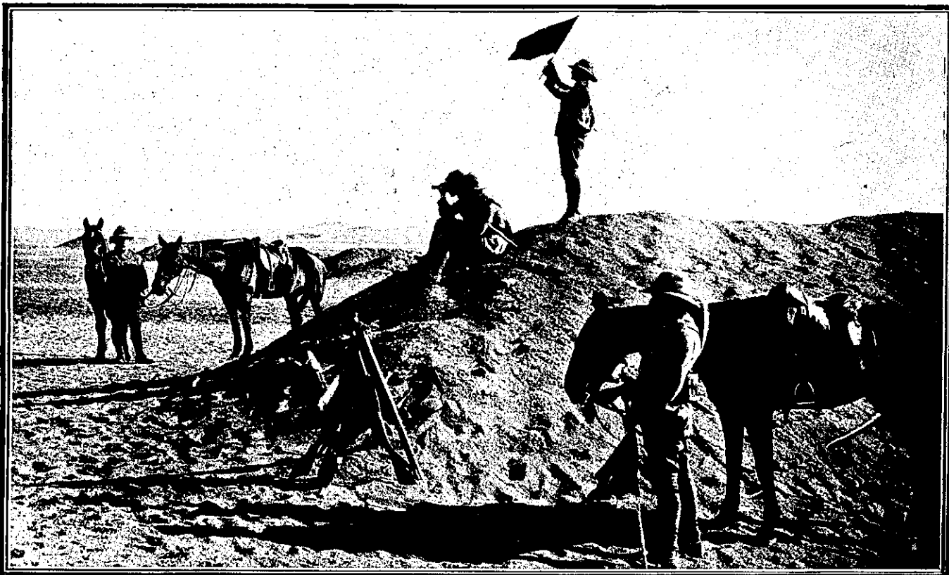
SIGNALLING OPERATIONS IN THE SANDY EGYPTIAN DESERT.