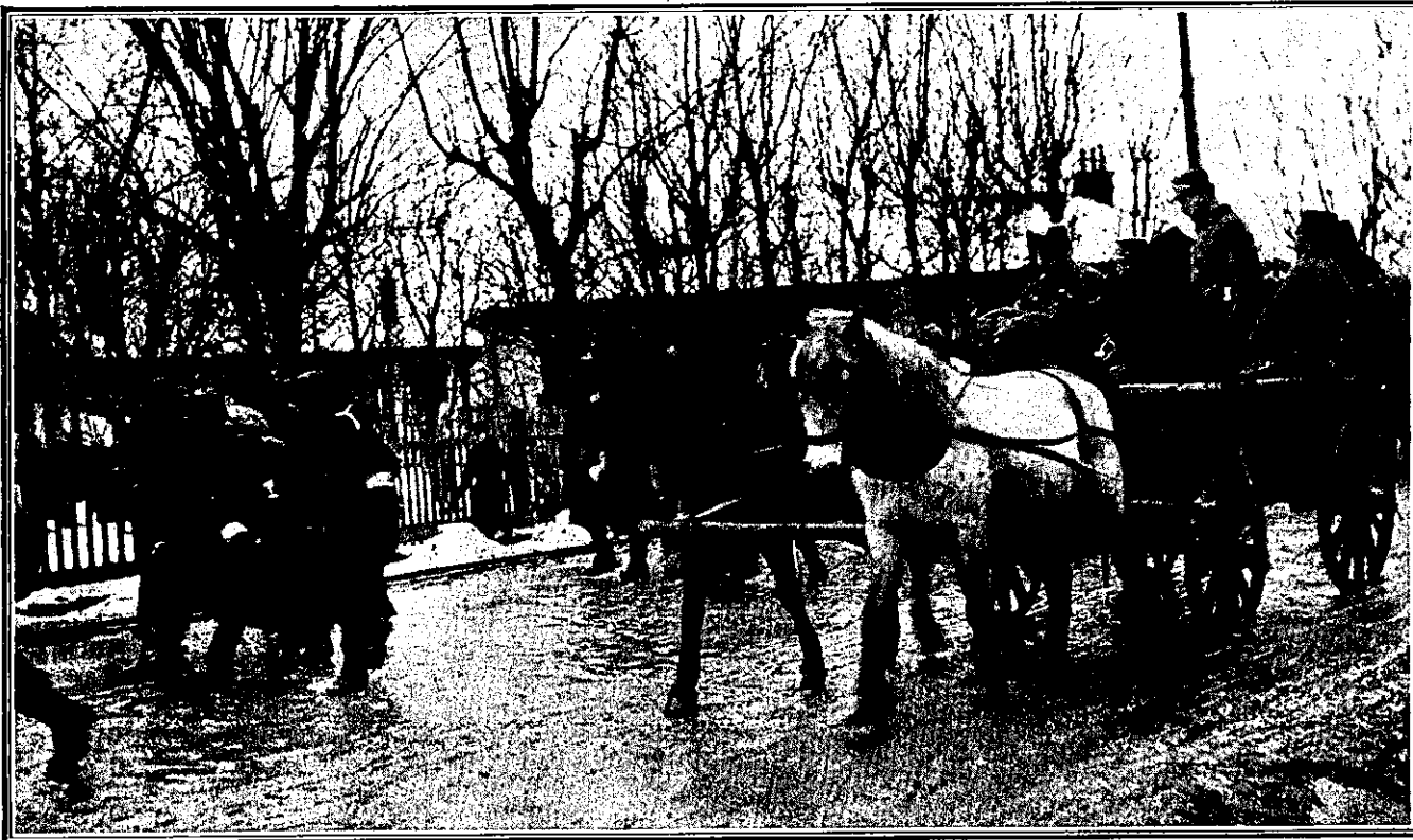
OFFICERS OF THE AUSTRIAN GARRISON ON THE WAY TO THE RAILWAY STATION. They drove, of course, having commandeered every available vehicle for their own use. The men, even if wounded, had to walk to Lemberg.