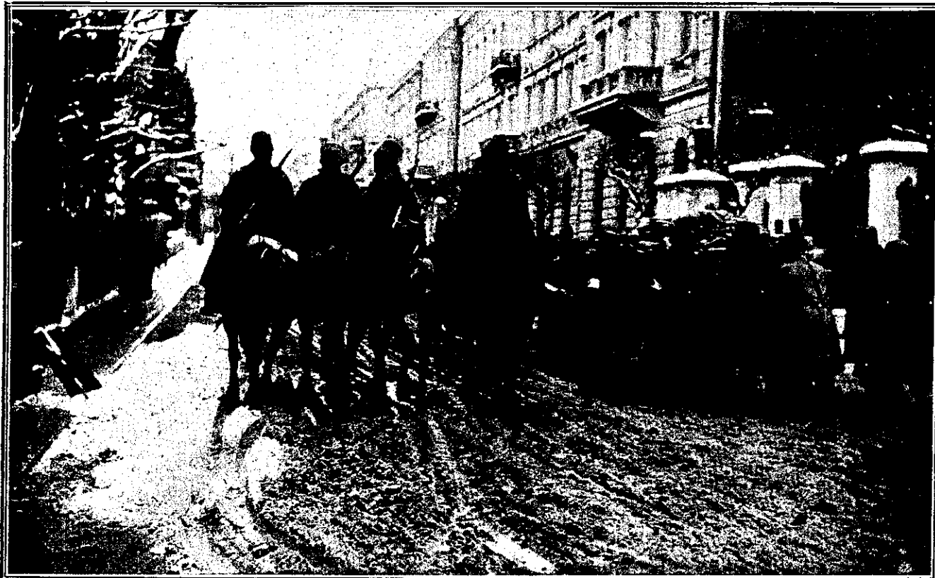
AUSTRIAN SOLDIERS PUSHING CARTLOADS OF BREAD INTO THE TOWN FOR THE RELIEF OF THEIR COMRADES.