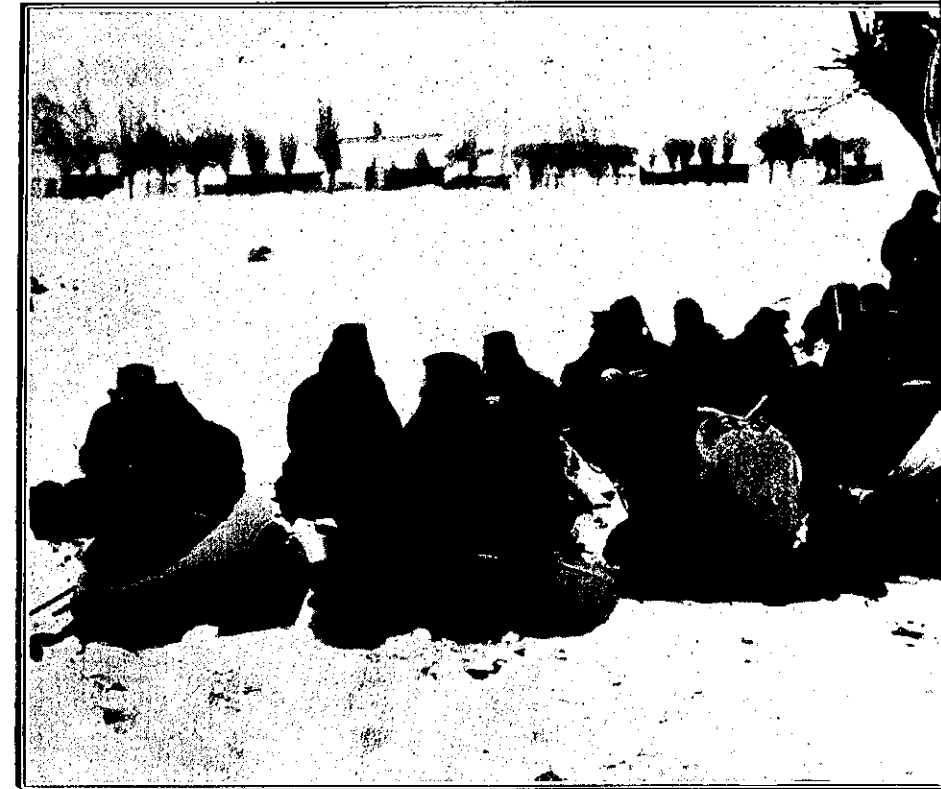
WEARY AND HUNGRY AUSTRIAN PRISONERS ON THEIR WAY TO OF PRZEMYSL. The 60 miles journey was accomplished through the snow in a famished condition after their starvation period during the