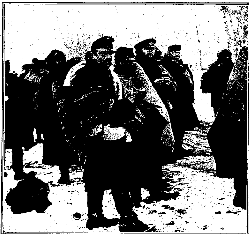
AUSTRIAN PRISONERS EN ROUTE TO LEMBERG. —Though they had been starved for weeks they had to make the 60-mile journey on foot through the snow.