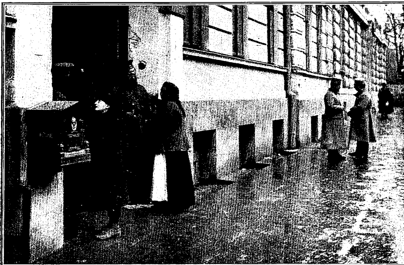
A WOMAN APPEALS TO A RUSSIAN SOLDIER FOR FOOD.