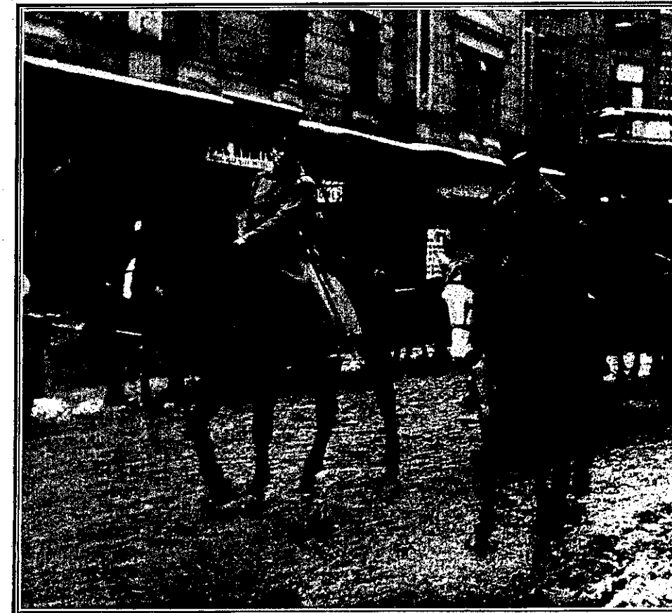
A RUSSIAN COLUMN PASSING ALONG ONE OF THE MAIN STREETS. THE SOLDIERS HAVE BROUGHT PROVISIONS.