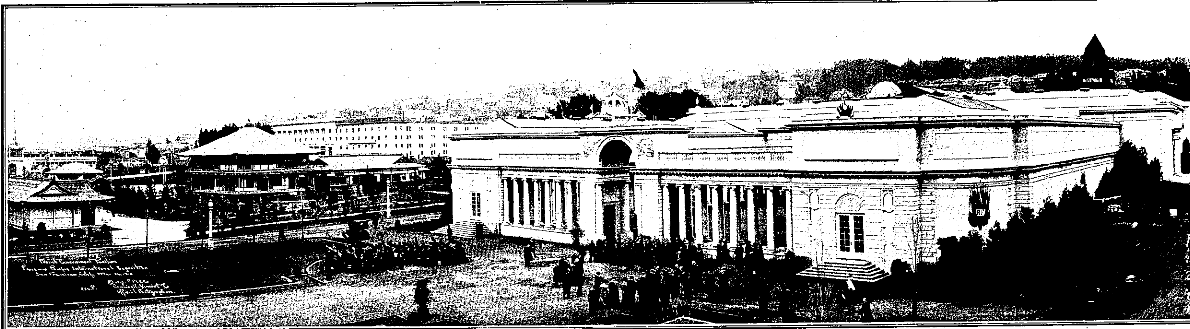
WHERE THE TRI-COLOUR OF FRANCE WAVED WITH OLD GLORY. THE FRENCH GOVERNMENT PAVILION, PANAMA-PACIFIC INTERNATIONAL EXPOSITION, SAN FRANCISCO. — United States Thomas R. Marshall on March 26 paid his official respects to the various pavilions of the foreign nations at the Panama-Pacific International Exposition at San Francisco. As he reached the Palace of the Legion of Honor, the French national pavilion, the tri-colour broke to the breeze side by side with Old Glory, while the strains of America were quickly followed by the Marseillaise. The French pavilion is an exact reproduction of the famous Palace of the Legion of Honor in Paris, and by special arrangement the formal opening of the pavilion had been deferred until the President of the United States would be the first person to step within it. France has established an exposition record in the construction of this pavilion. The plans were drawn in three days after the President had spent £400 in one cablegram forwarding the general specifications. After this, three shifts of workmen were employed, and the £20,000 pavilion came into being like a magic palace. The stone, and the effect of this has been admirably preserved. On slightly rising ground, facing north toward San Francisco Bay, this noble edifice commands a conspicuous site. It is one of the pavilions to greet the visitor passing along the beautiful Avenue of the Nations. To the left of the picture are the pavilions and gardens of Japan.