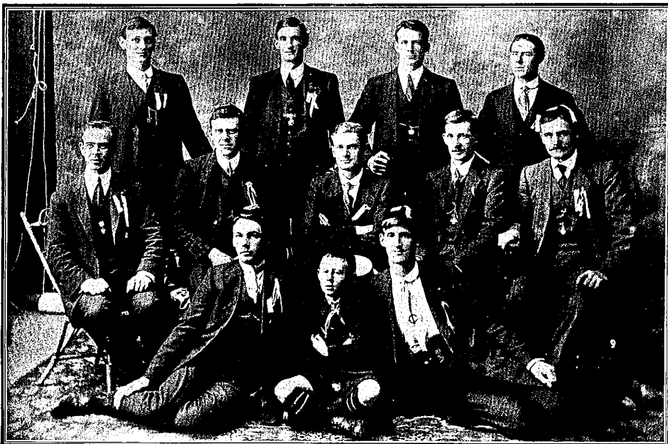
THE INVERCARGILL RAILWAY ROWING CLUB.