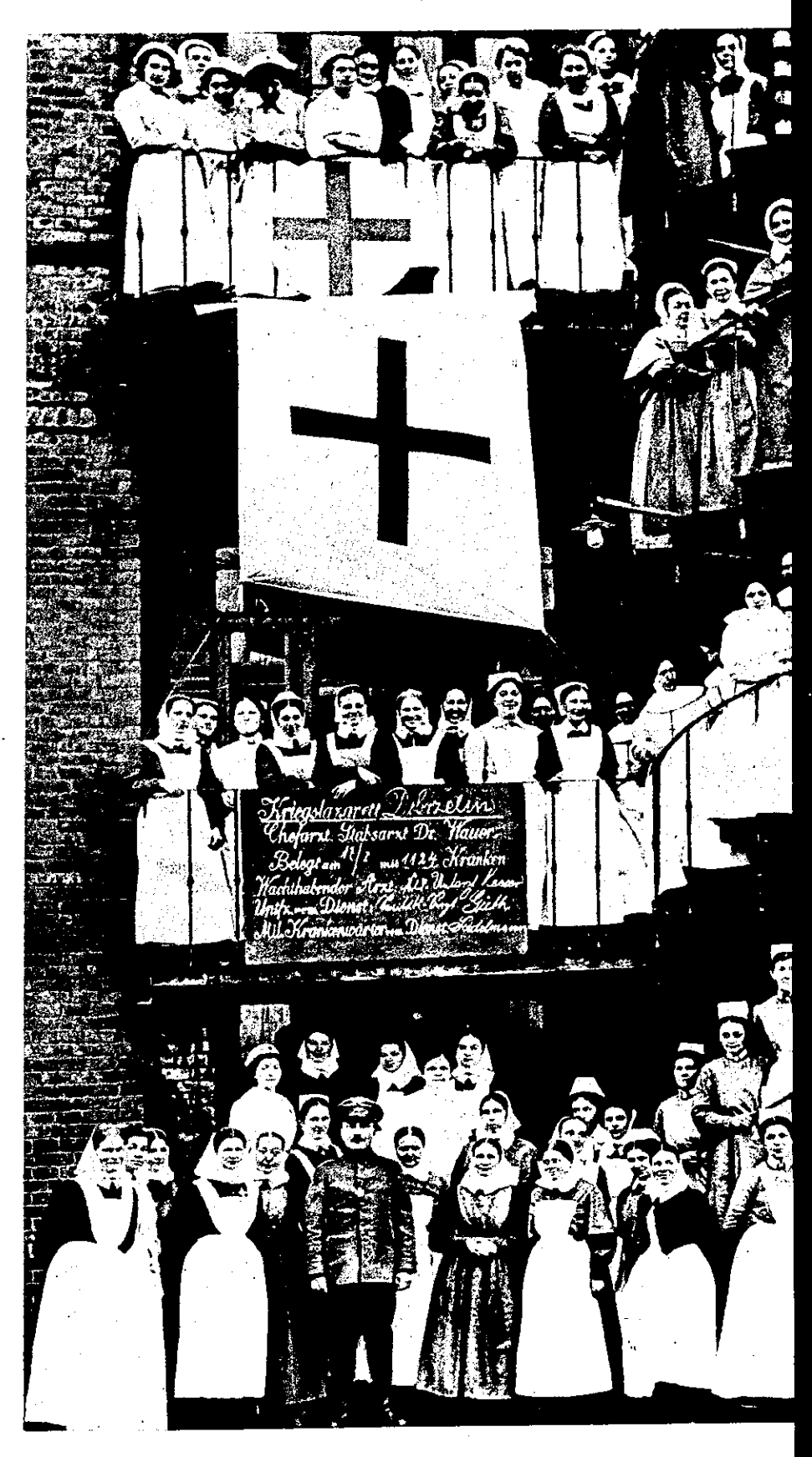
STAFF OF NURSES AT THE GERMAN WAR HOSPITAL IN DO