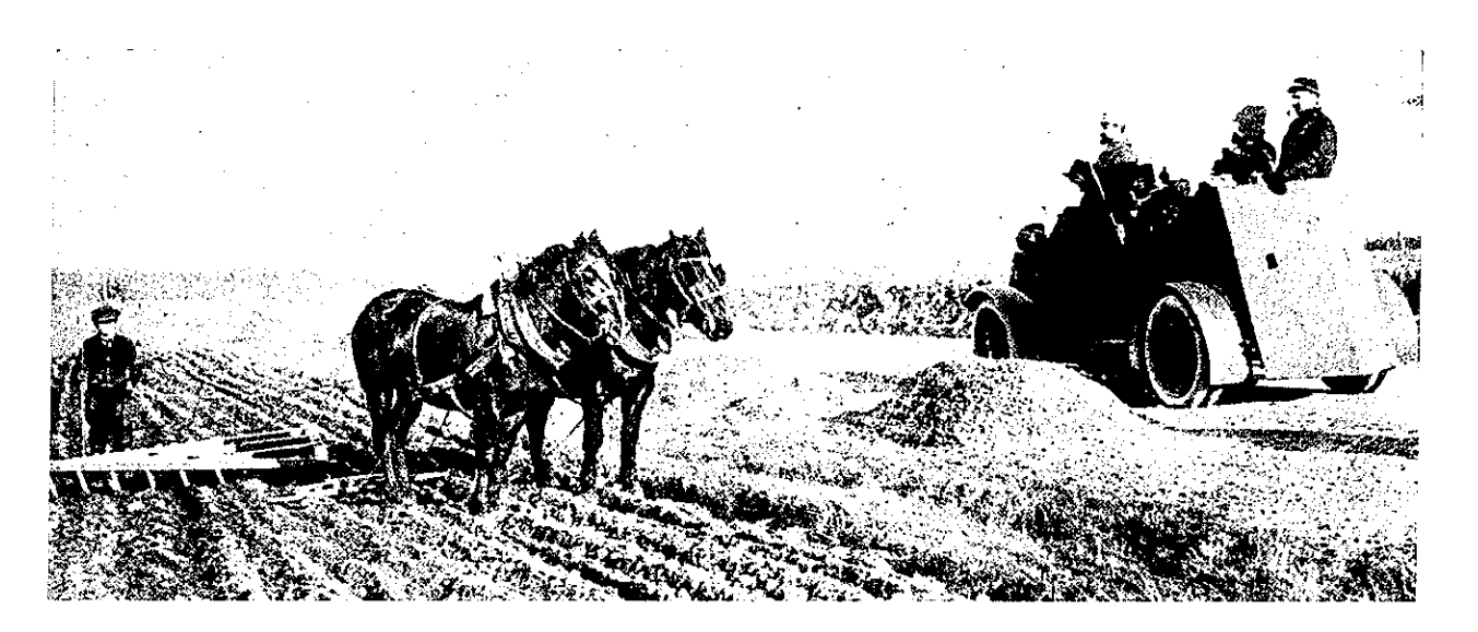
PATHS OF PEACE AND PATHS OF WAR IN NORTHERN FRANCE.