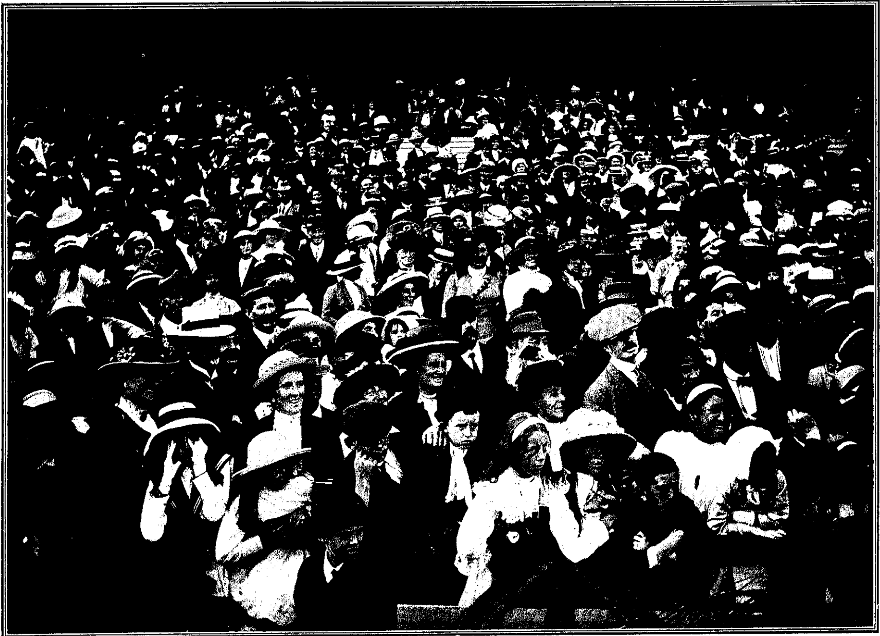
INTERESTED SPECTATORS AT THE RACECOURSE WATCHING THE MAORI HAKA.

HELD FOR THE PURPOSE OF RAISING FUNDS FOR THE BEAUTIFICATION OF THAT TOWN.