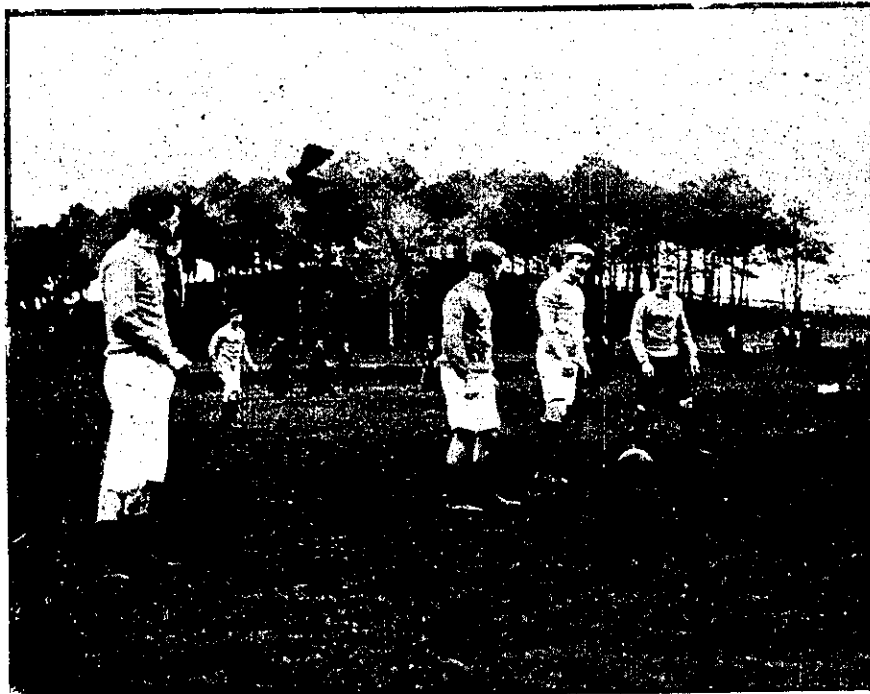
Association Match.—Thistle Club v. H.M.S. Phoebe. The kick off.