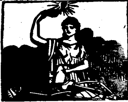
A FRIEND IN NEED.