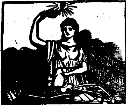
A FRIEND IN NEED.