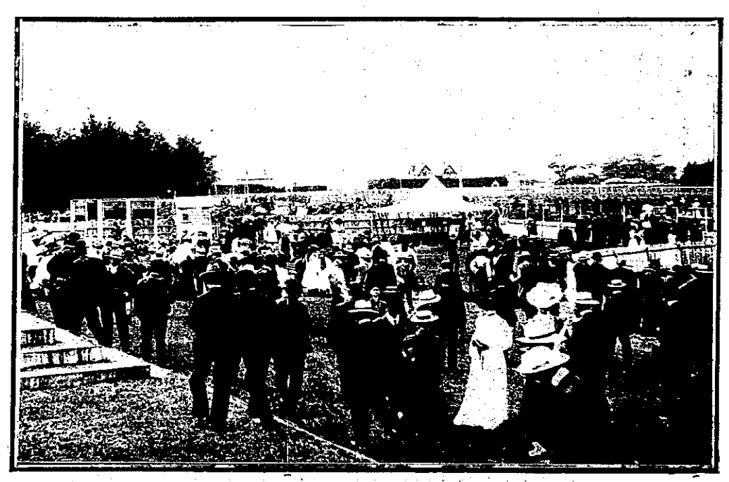
PATRONS OF THE ENCLOSURE.