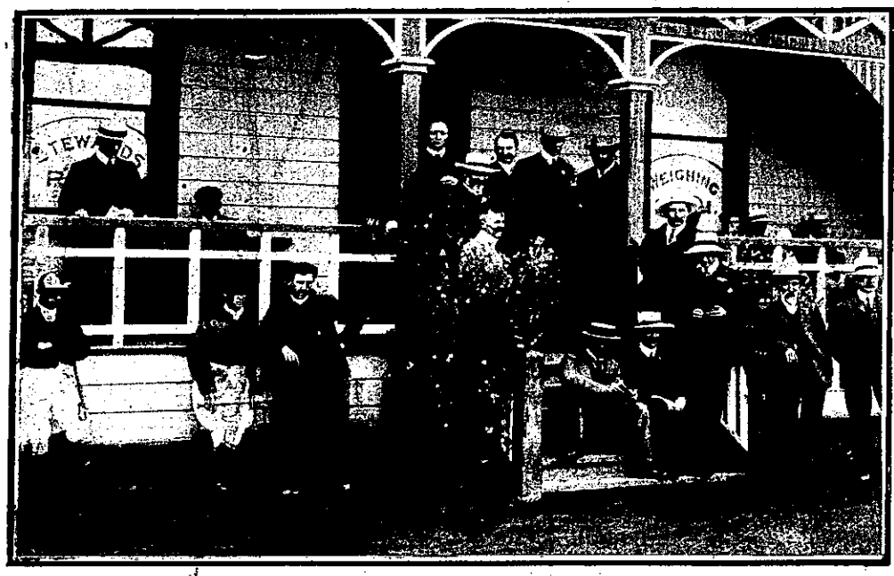
OFFICIALS OF THE MANAWATU R.C.