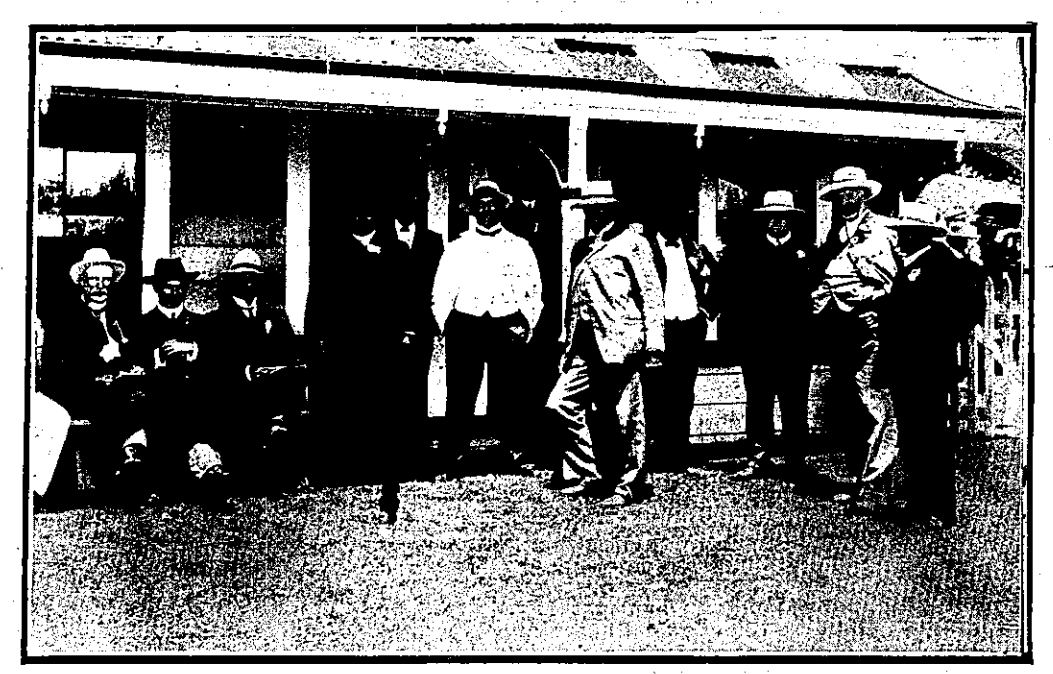
STEWARDS OF THE TARANA KI J.C.