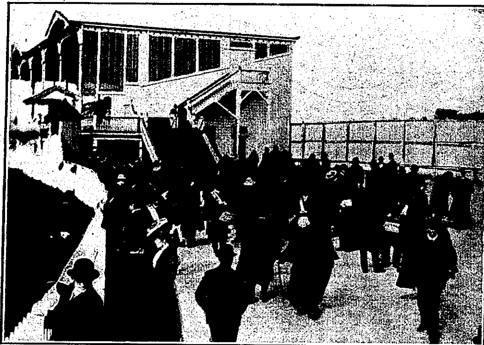
AMONG THE BOOKMAKERS.