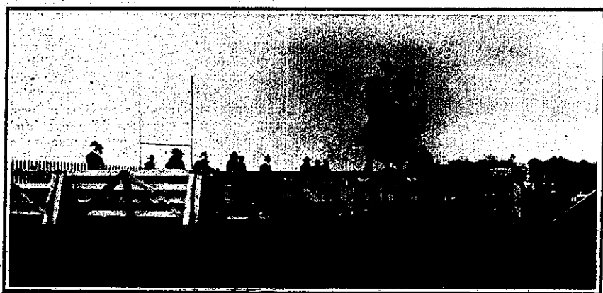
THE HUNTERS' STEEPLECHASE First Time Round.