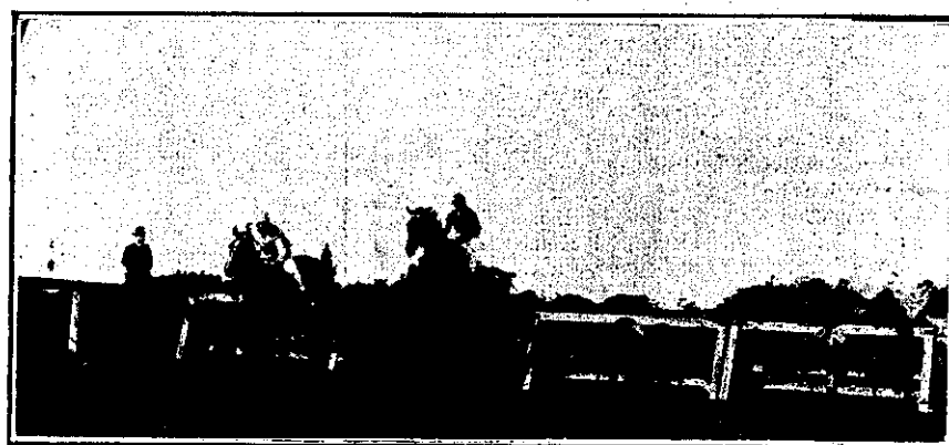
THE HUNTERS' STEEPLECHASE. Second Time Round.