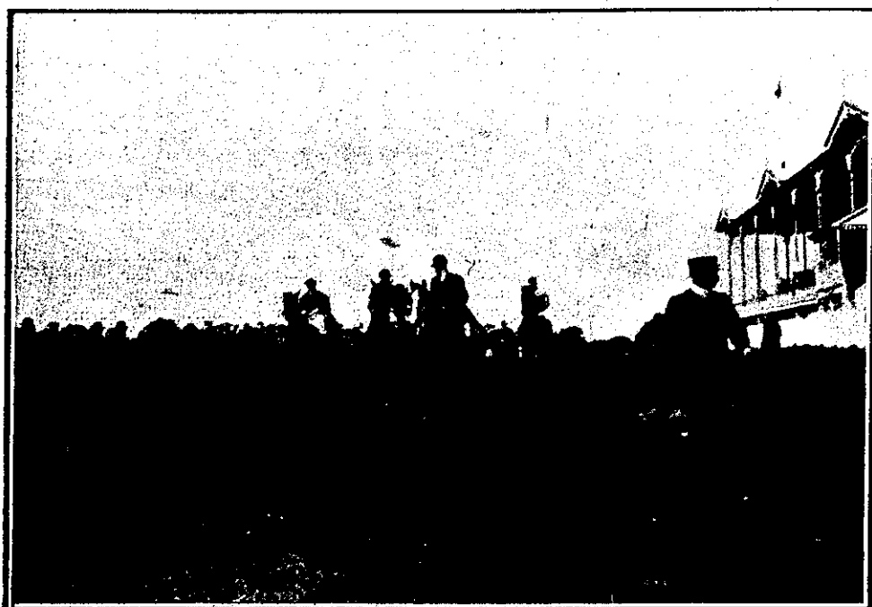
BRINGING IN THE WINNER OF OPEN FLAT RACE.