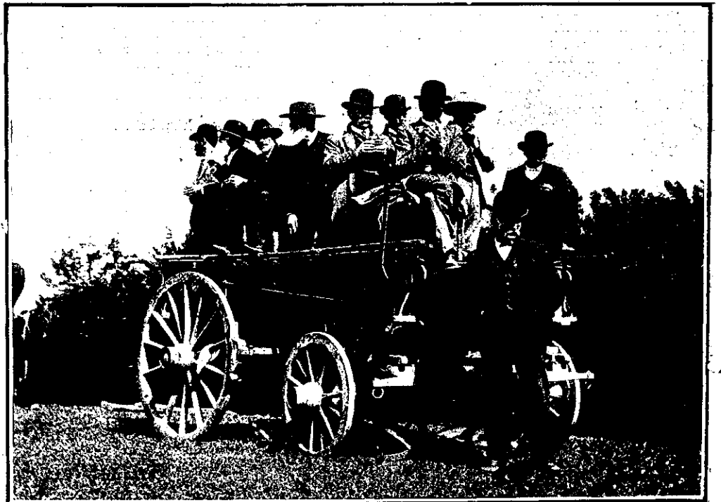
SOME OF THE COMMITTEE.