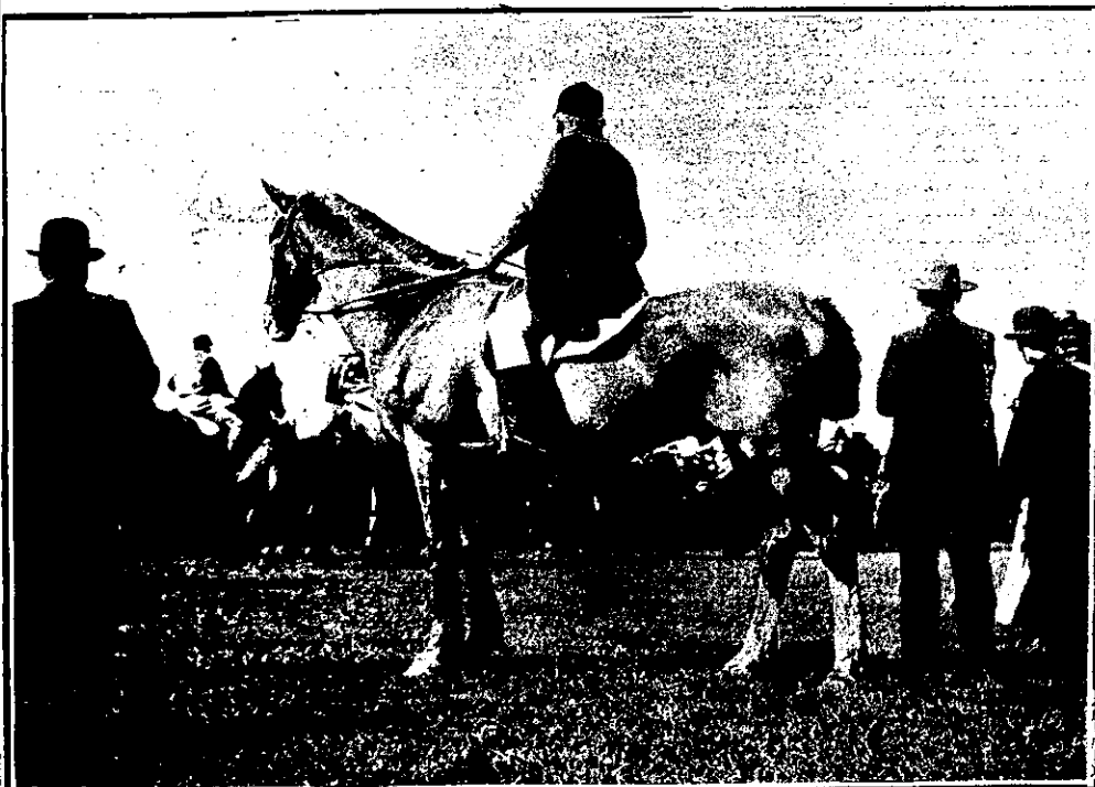
THE CLERK OF THE COURSE.