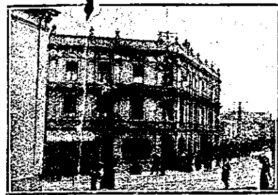
DUKE OF EDINBURGH HOTEL, WELLINGTON.