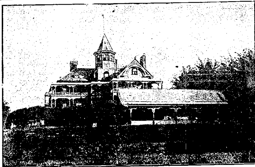
LAKE HOTEL, TAKAPUNA.