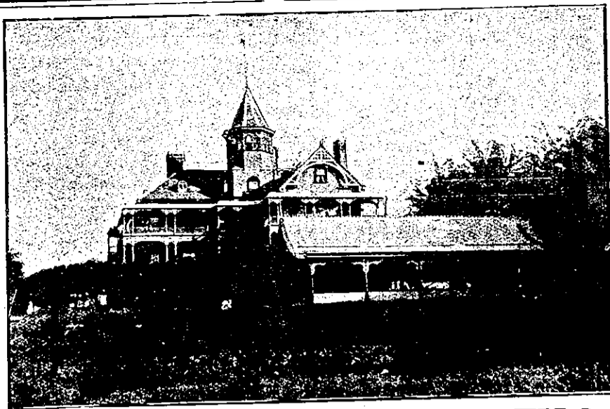
LAKE HOTEL, TAKAPUNA.

This Hotel is now one of the largest in the Waikato. All trains stop at Huntly, and the Hotel is a few yards from the Station. First-class Accommodation and excellent table.