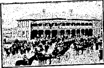
PALACE HOTEL, THE PREMIER HOTEL OF TE AROHA.