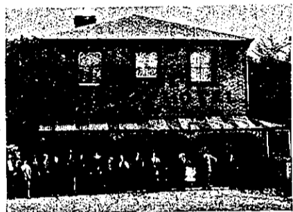
TRAMWAY HOTEL, KARANGHAKE, ACROSS THE BRIDGE.