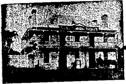
JUNCTION HOTEL, EPSOM

Buses and trams pass here on their way to and from Mairangi Racecourse and Alexandra Park, Football Ground