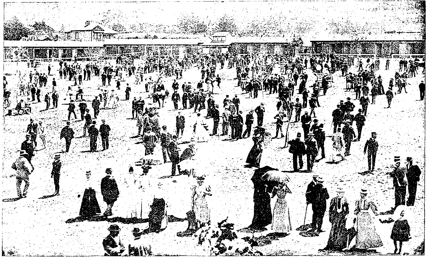
IN THE SADDLING PADDOCK.