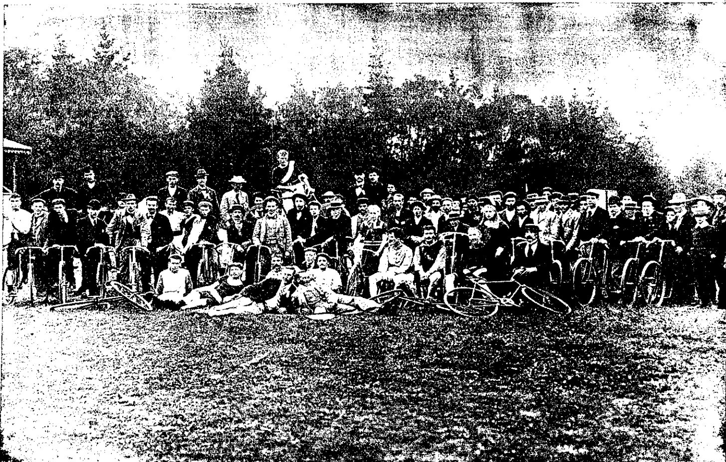
A GROUP OF COMPETITORS AND TRAINERS AT THE WANGANUI AND WEST COAST CASH CYCLING CLUB'S MEETING, THURSDAY, 18TH MARCH, 1897.