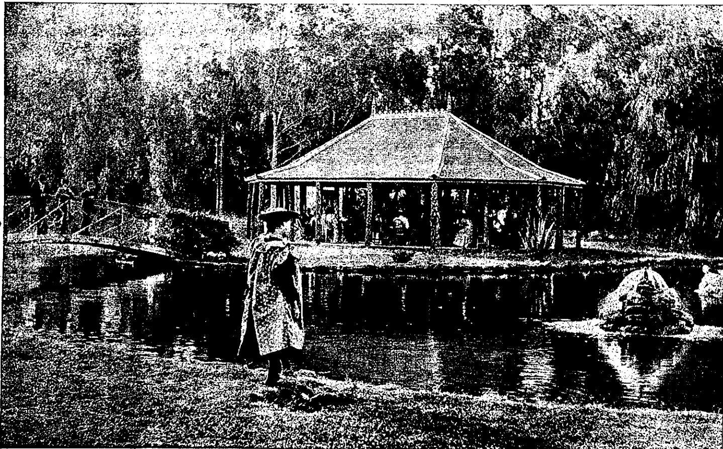
VIEW of LAKE and TEA PAVILLION.