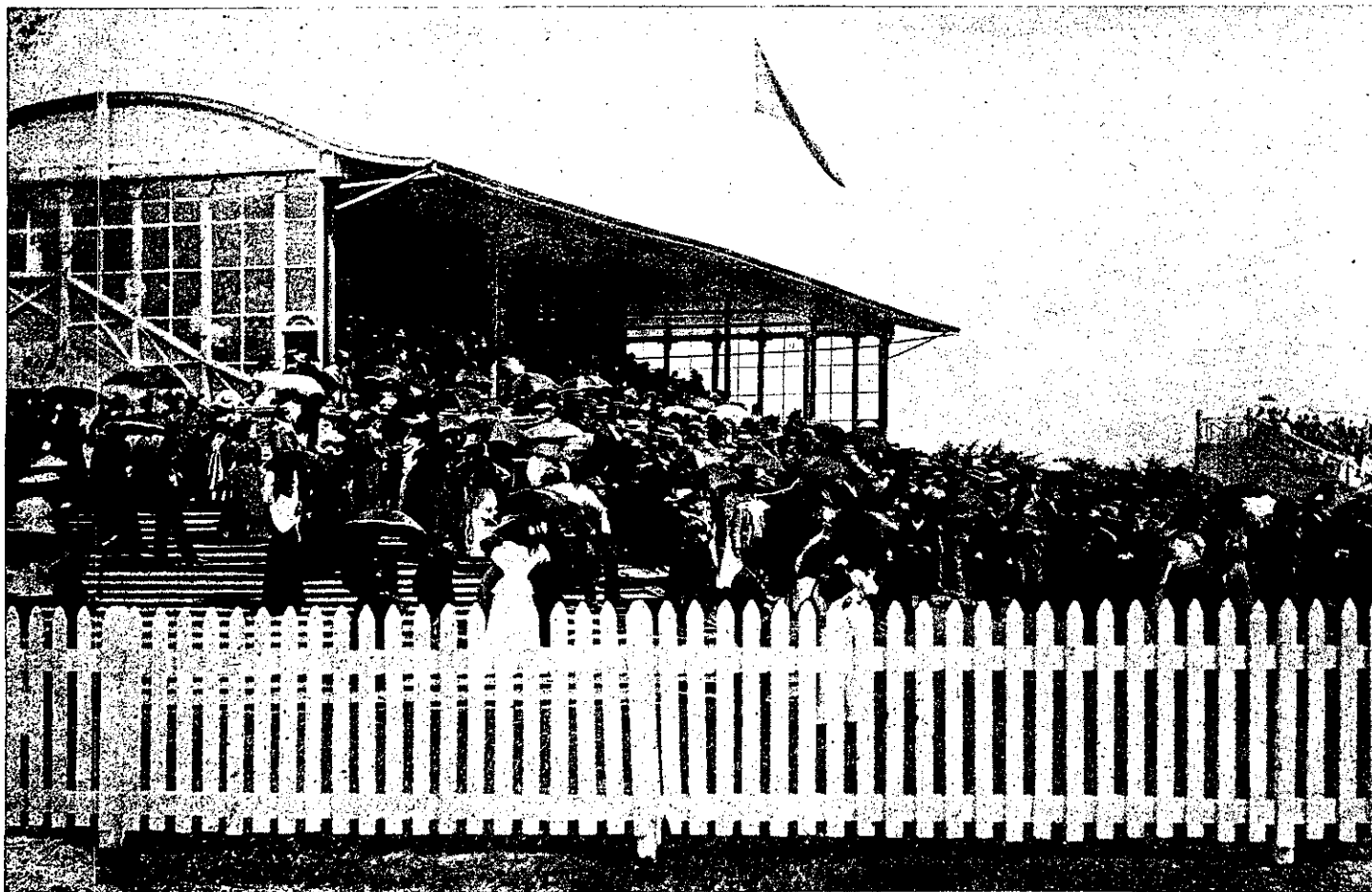
VIEW OF THE STAND.