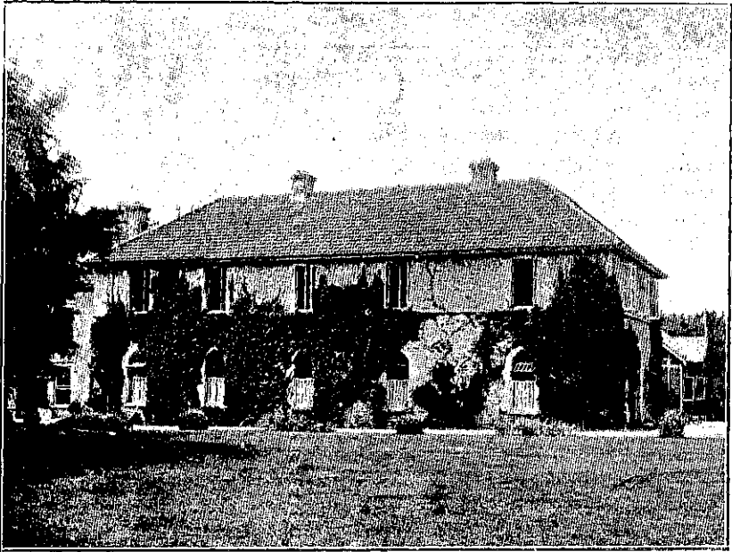
The Sanatorium, Nordrach-upon-Mendip.