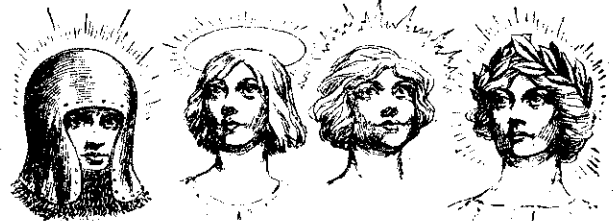
As they think they are.