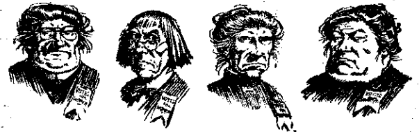
As they are