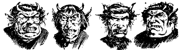
As they appear to the police and shopkeepers.