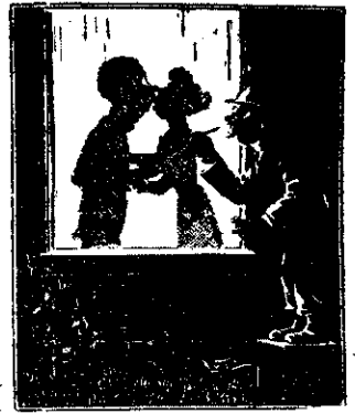
OUTLINING THE EVIDENCE.