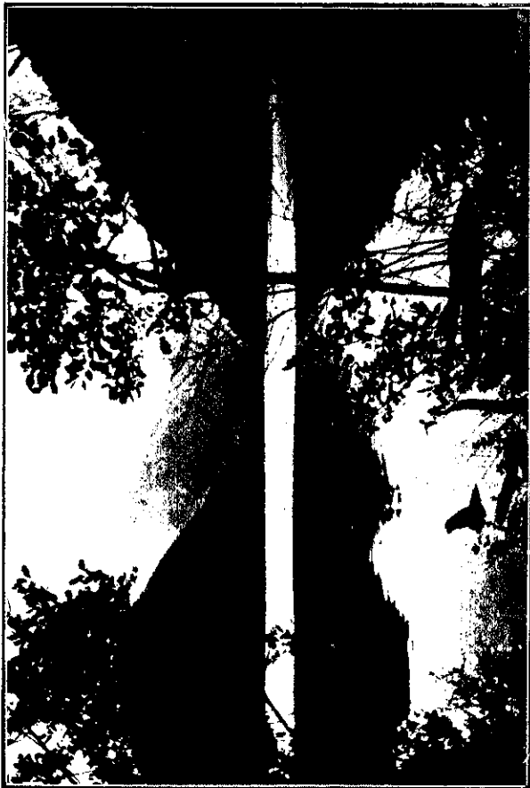
AT THE HEAD OF LAKE TE ANAU, OTAGO.