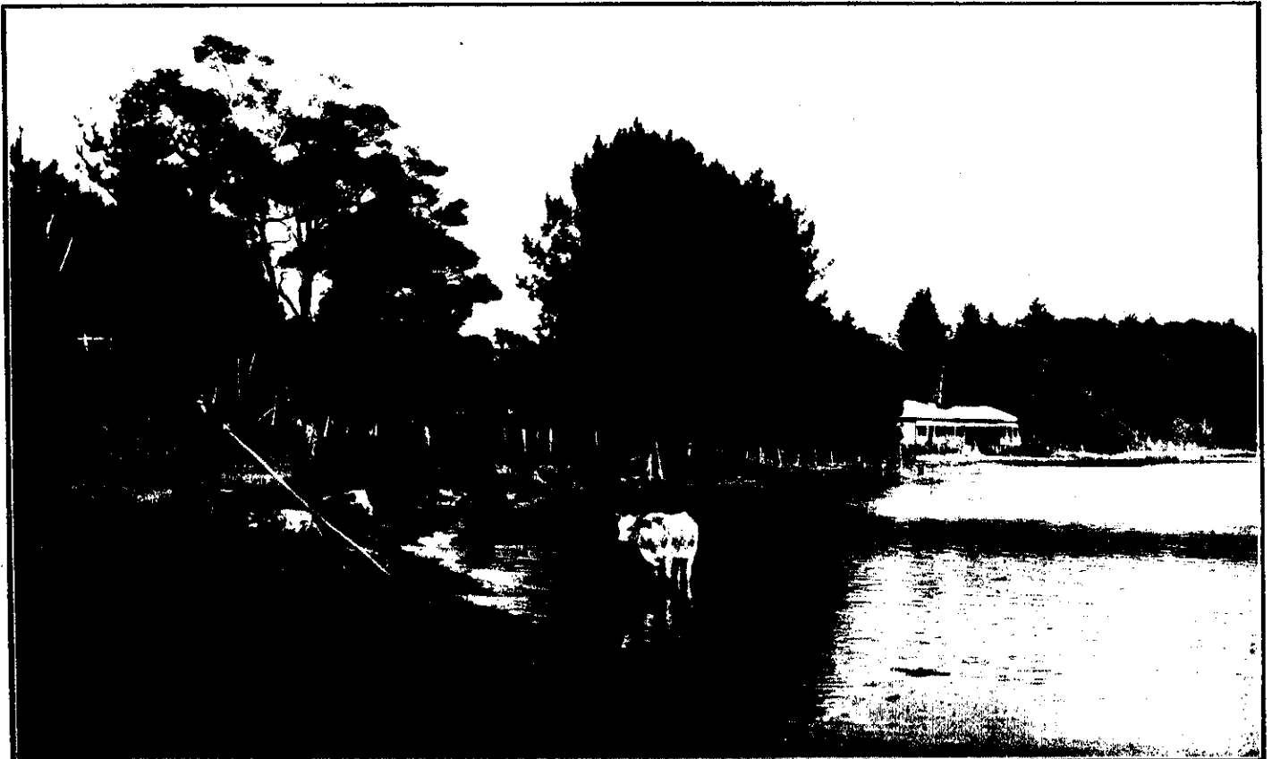
A SCENE AT MULLET POINT, A FAVOURITE SUMMER RESORT NEAR AUCKLAND.

This fine building was erected from the money left to Oxford University by John Radcliffe, an English physician, who died in 1714. Bartholomew's Hospital, London, was also enlarged from funds bequeathed by him.