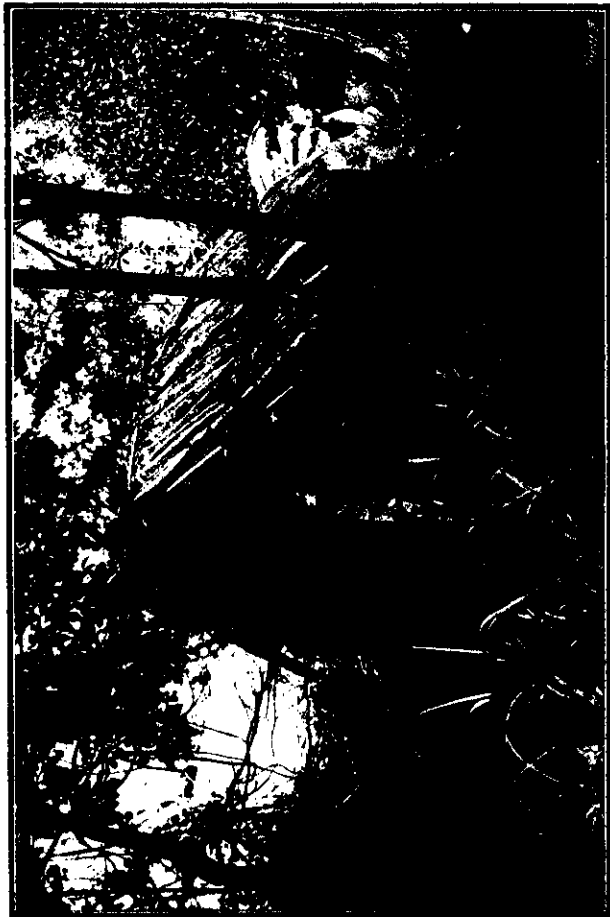
A RUSH HUT AT PORT FITZROY, GREAT BARRIER.