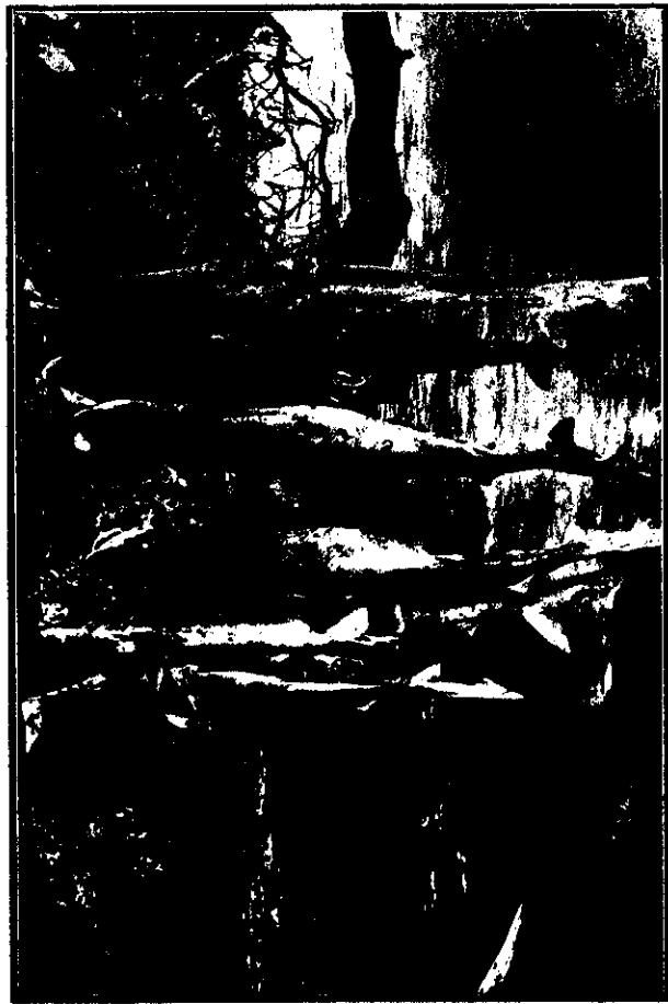
THE RESULT OF A MORNING'S SHARK FISHING AT PORT FITZROY, GREAT BARRIER. Sharks are plentiful in the warm waters of the Hauraki Gulf during the summer, and nearly every fisherman considers it his duty to wage war against them. Shark-fishing is an exciting sport, which is to be enjoyed at many places close to Auckland. The photo shows half a dozen sharks, averaging about six feet in length.