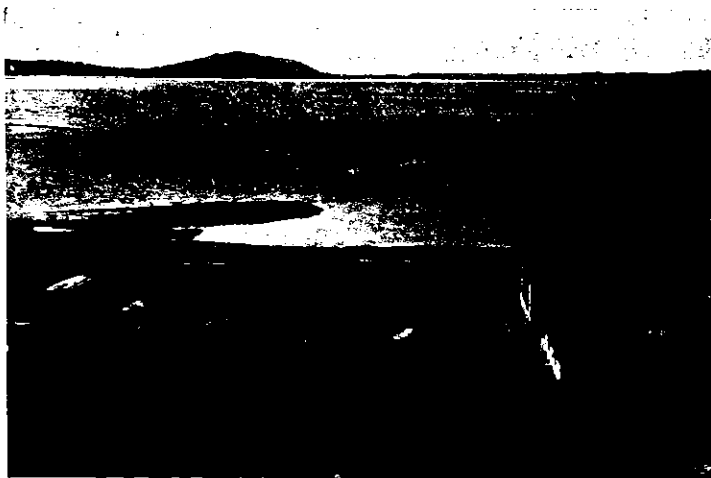
View Across Lake Rotorua from the Balcony of the Lake House Hotel.

Among the Great Attractions this Popular Hotel has to offer are