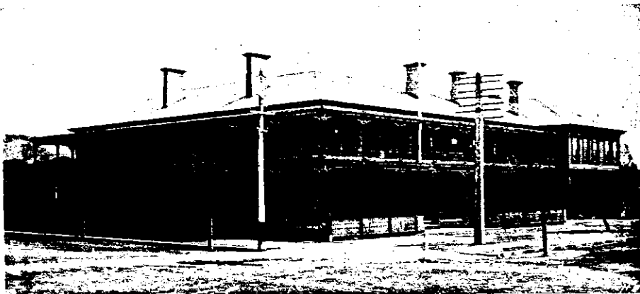
GRAND HOTEL, ROTORUA.

THE GOVERNORS OF AUSTRALIA AND NEW ZEALAND AND ADMIRAL SPERRY.