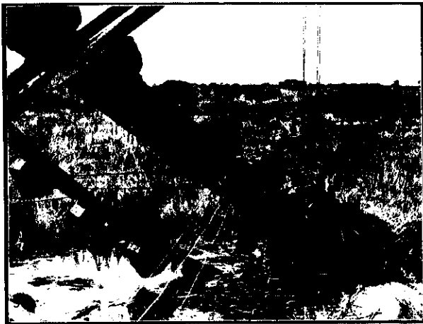
THE BUCKET DREDGE AT WORK.