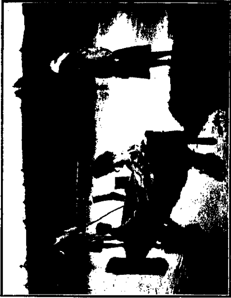
HOLIDAY TIME—AT TAHERI MOUTH.