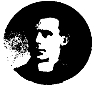
RIGHT REV. DR. DANIEL MANNIX.