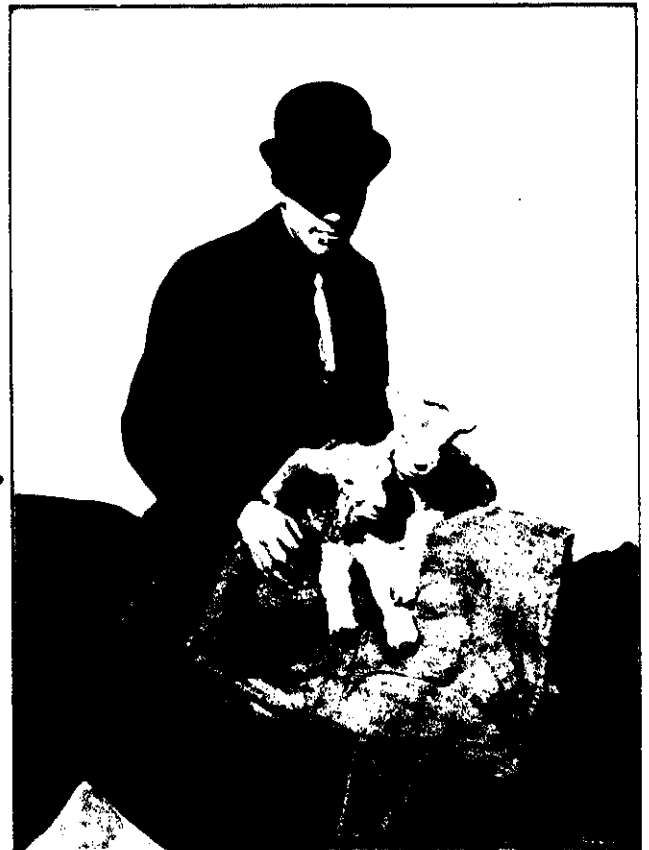
THE FIRST OF THE SEASON.

The photo shows the new police uniform which has been adopted in the Dominion. The shako is replaced by a helmet, and the tunic is different from the pattern now in use.