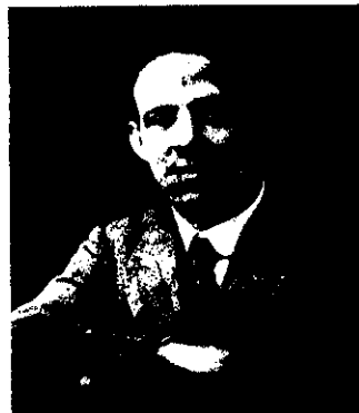
See "Our Illustrations."