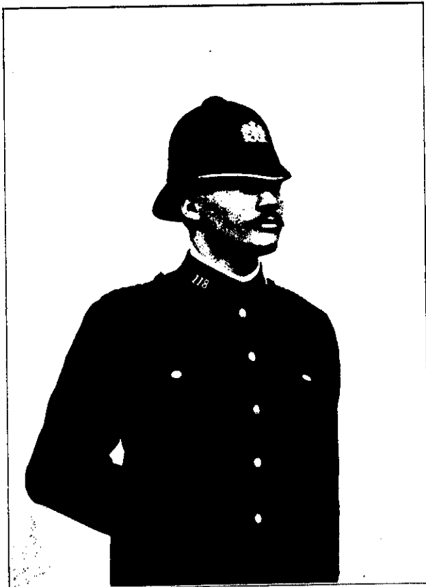
THE NEW ZEALAND POLICEMAN'S NEW UNIFORM.

The photo shows the new police uniform which has been adopted in the Dominion. The shako is replaced by a helmet, and the tunic is different from the pattern now in use.