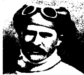
THE AIRMAN IDOL OF FRANCE.

Who has been appointed organising secretary of the Bible-in-Schools movement in New Zealand.