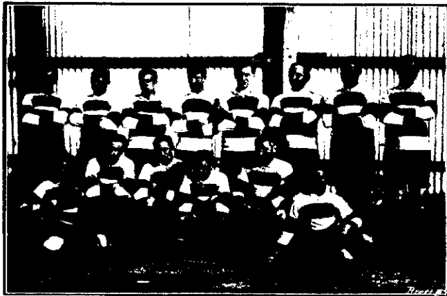
THE AUCKLAND REPRESENTATIVES.