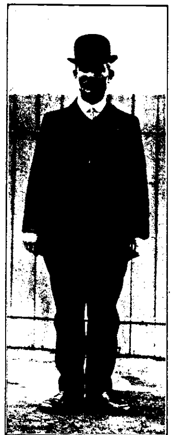
AUCKLAND'S NEW CHIEF-DETECTIVE.

In flying at Rheims in a Deperdussin monoplane, M. Jules Vedrines, the celebrated French airman, covered 125 miles in 70min. 20sec. This is a record in aviation.