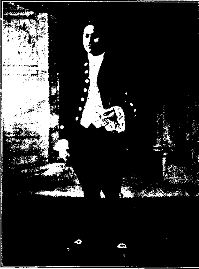
A MAORI CHIEFTAIN PRESENTED TO THE KING.