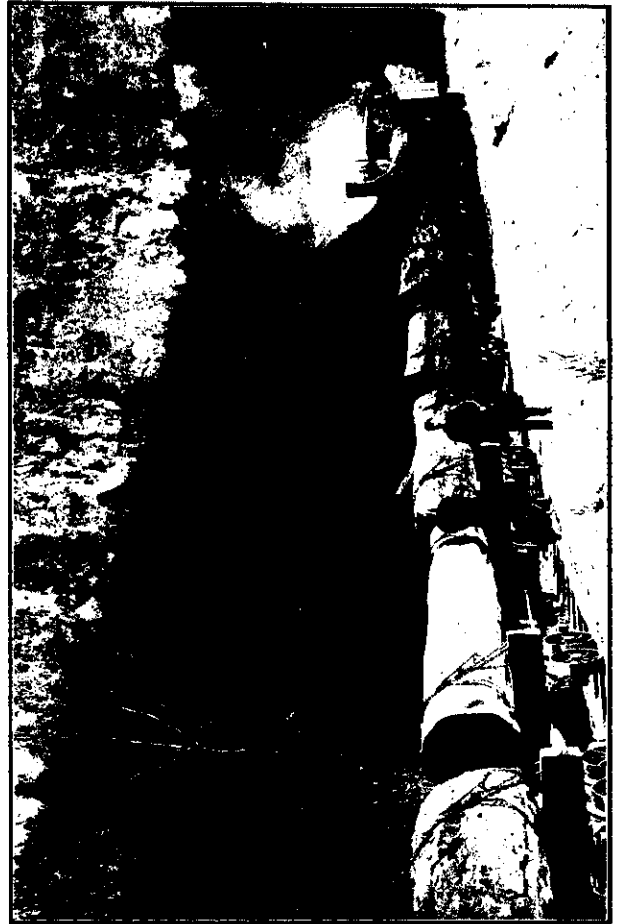
A THIN LOAD OF RIMU LOGS FROM THE SELWYN COMPANY'S BUSH NEAR PUTARURU.