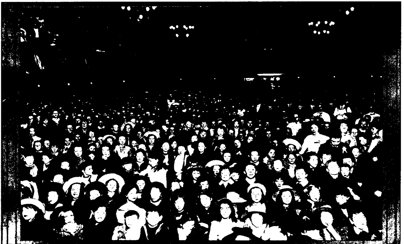
A FLASHLIGHT PHOTO, OF AN ENTERTAINMENT GIVEN TO 800 OF LONDON'S POOR CHILDREN.