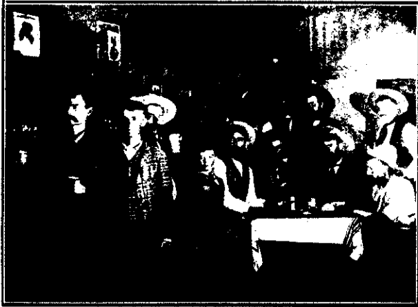
THE INTERIOR OF A WESTERN GAMBLING SALOON. This meeting ended with a pistol-shooting affray.

the operation, much to their delight and astonishment. Naturally enough, they had never seen a flashlight photograph taken before, and were quite unprepared for the brilliant spurt of flame and loud report. The night was a dark one, and the plains were illuminated for a great distance around, and, although the cowboys soon recovered from the shock, the effect on the cattle was much more alarming, for they promptly stampeded. Off across the plains they dashed in all